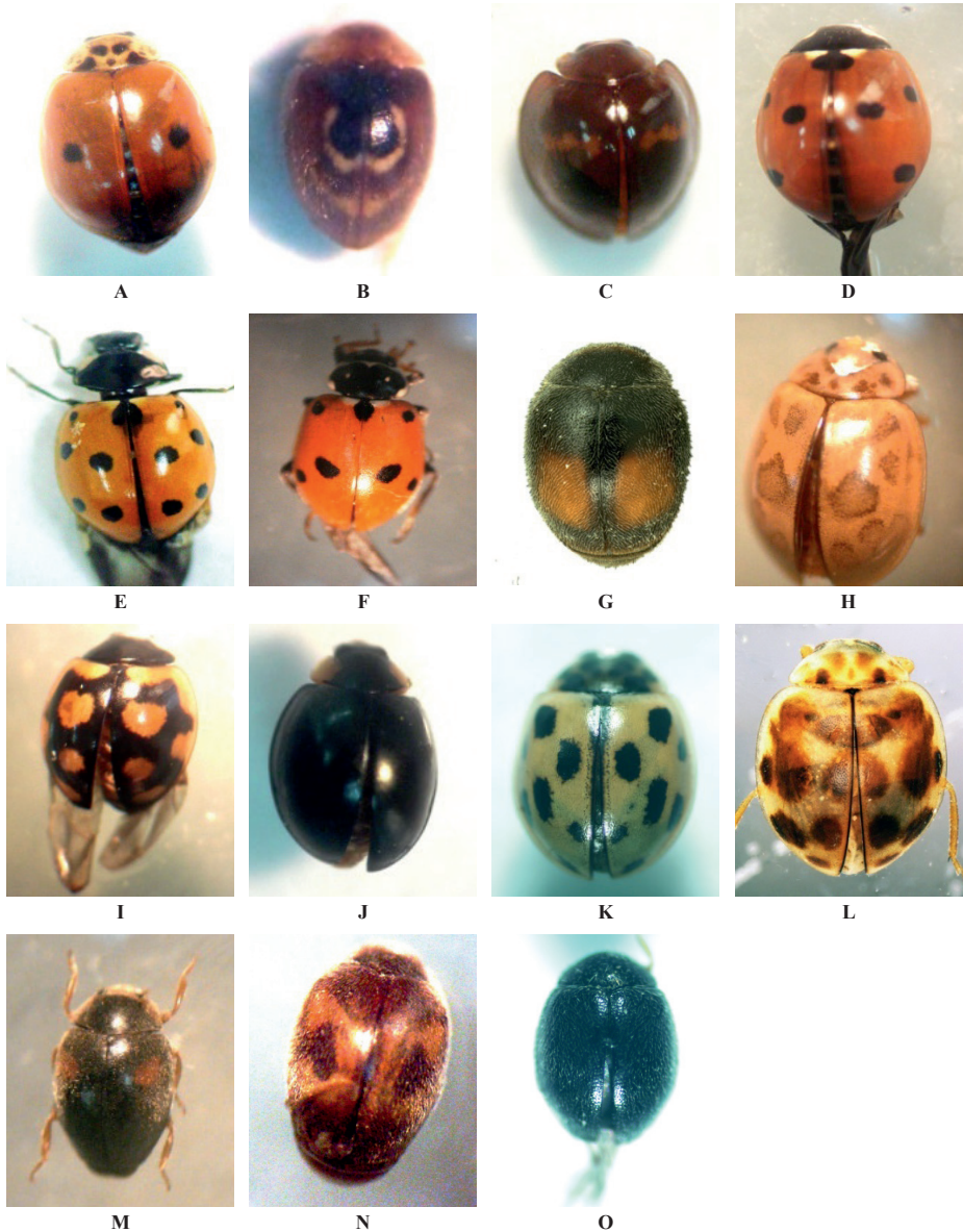
A: Adalia bipunctata , B: Clitostethus arcuatus , C: Chilocorus bipustulatus , D: Coccinella septempunctata , E: Coccinella undecimpunctata , F: Hippodamia variegata , G: Nephus nigricans , H: Oenopia conglobata , I: Oenopia oncina , J: Parexochomus nigromaculatus , K: Propylea quatuordecimpunctata , L: Psyllobora bisoctonotata , M: Scymnus frontalis , N: Scymnus syriacus , O: Stethorus gilvifrons (Original photographs).