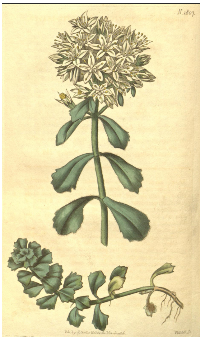
Fig. 2 Neotype of Phedimus spurium (M. Bieb.) 't Hart subsp. oppositifolius (Sims) L. Gallo comb. et stat. nov. Illustration taken from Sims (1816).

located in poor thin soils, even in rock crevices" (Batsatsashvili et al. 2016, p3) and on rocks in the high-altitude pastures (Nakhutsrishvili 1999, p118 and p133). Sedum oppositifolium was furthermore found to be naturalized in Germany (Vollrath & Lauerer 2005, p299). To summarize, this taxon is sufficiently morphologically distinct and geologically separate from Phedimus spurium to deserve a subspecific rank. Its taxonomic relationship with Crassula crenata Desf. (= Phedimus crenatus (Desf.) V. Byalt has yet to be evaluated (cfr. Borissova 1939, p58; Byalt 2001, p284). The subspecific combination under Phedimus has been lacking up to now (see also Essl & Rabitsch 2002, p128), and is provided here, together with the typification.