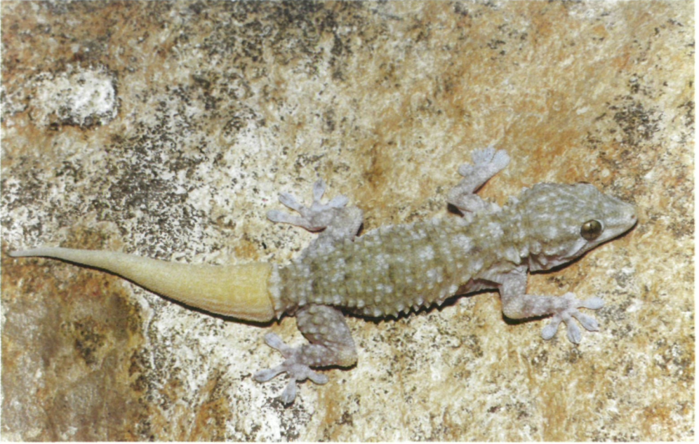
Fig. 2: Tarentola mauritanica pallida nov. subsp., Khnifiss lagoon, south-western Morocco (terra typica).