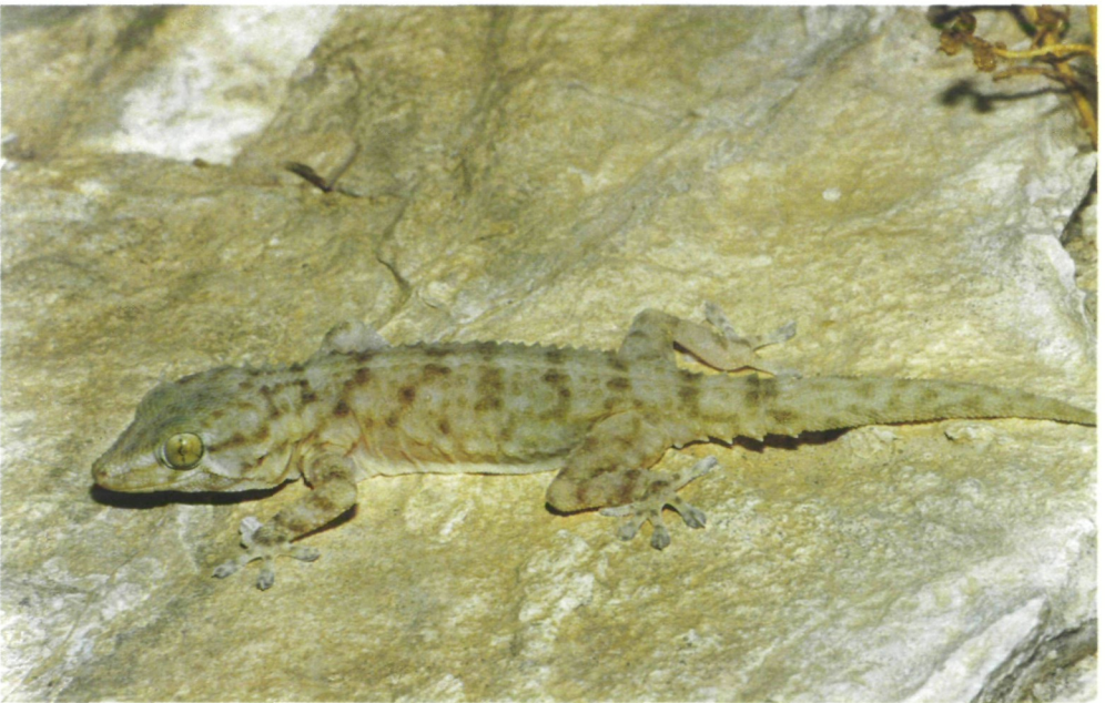
Fig. 3: Tarentola mauritanica pallida nov. subsp., paratype (MNHN 1998-392), Dchira, Western Sahara.