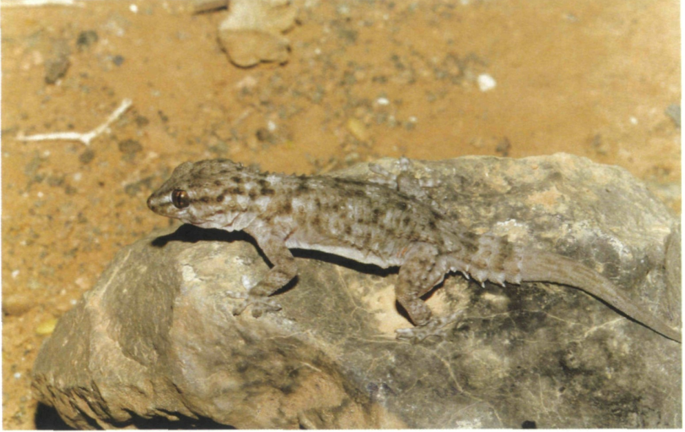
Fig. 4: Specimen intermediate between Tarentola mauritanica juliae and T. mauritanica pallida , nine km beyond Tilemsoun toward Tantan, south-western Morocco.

Abb. 4: Intermediäres Exemplar zwischen Tarentola mauritanica juliae und T. mauritanica pallida , neun km von Tilemsoun in Richtung Tantan, südwestliches Marokko.