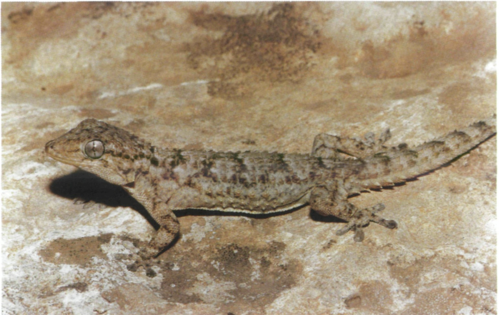
Fig. 5: Tarentola mauritanica juliae , Ademine forest, south western Morocco.

Abb. 4: Intermediäres Exemplar zwischen Tarentola mauritanica juliae und T. mauritanica pallida , neun km von Tilemsoun in Richtung Tantan, südwestliches Marokko.