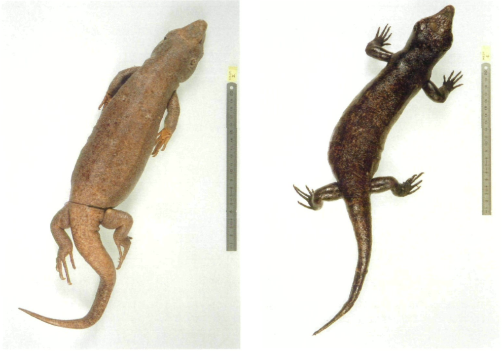
Fig. 3: The alcohol preserved specimen MZST R2 (left) and the mounted specimen MZST R4 (right) of Macroscincus coctei at the Treviso collection can be referred to PERACCA's importation.

Abb. 3: Das in Alkohol konservierte Exemplar MZST R2 (links) und das montierte Trockenpräparat MZST R4 (rechts) von Macroscincus coctei an der Treviser Sammlung können auf einen Import PERACCAS zurückgeführt werden.