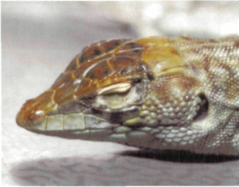
Fig. 3: Adult male Acanthodactylus taghitensis GENIEZ & FOUCART, 1995 from Ouan n'Namour, Mauritania (BEV.7785).