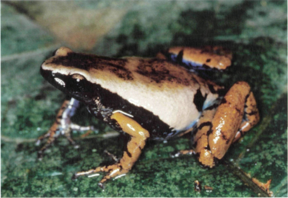
Fig. 2a: Adult male Cardioglossa alsco sp. n. (ZFMK 77678). Abb. 2a: Adultes Männchen von Cardioglossa alsco sp. n. (ZFMK 77678).