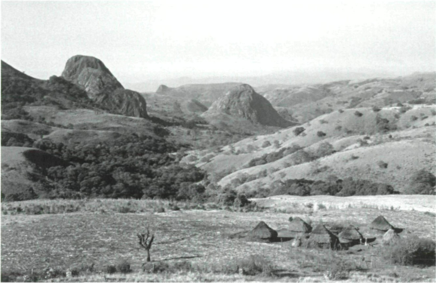
Fig. 3: Gallery forest habitat of Cardioglossa alsco sp. n. on the immediate southern side of the Tchabal Mbabo Mtns' rim.