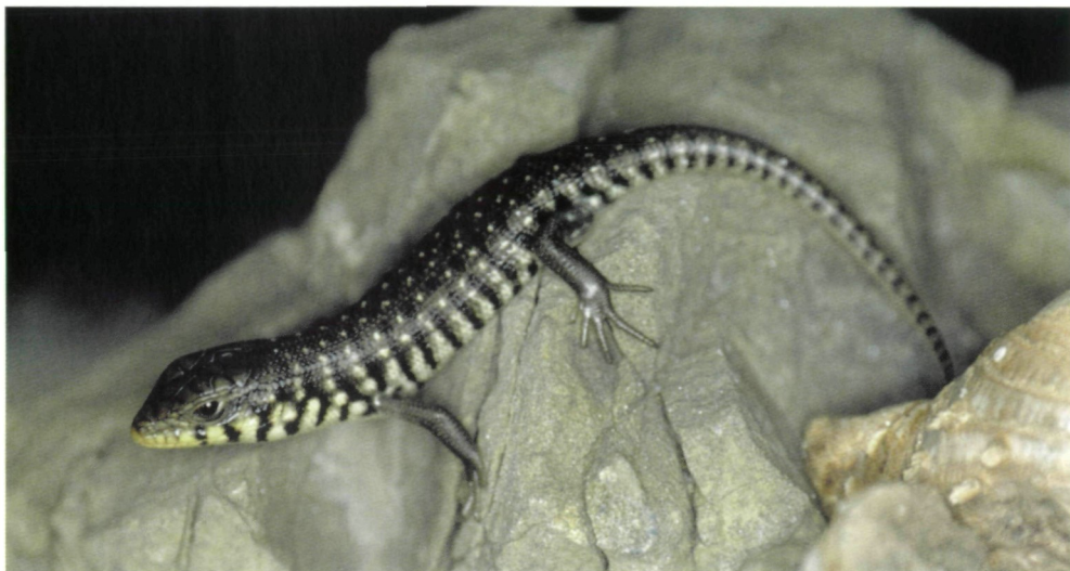
Fig. 7: A few days old specimen of Trachylepis dichroma sp. nov. (Photo: P. HARBIG).

Abb. 7: Wenige Tage altes Jungtier von Trachylepis dichroma sp. nov.