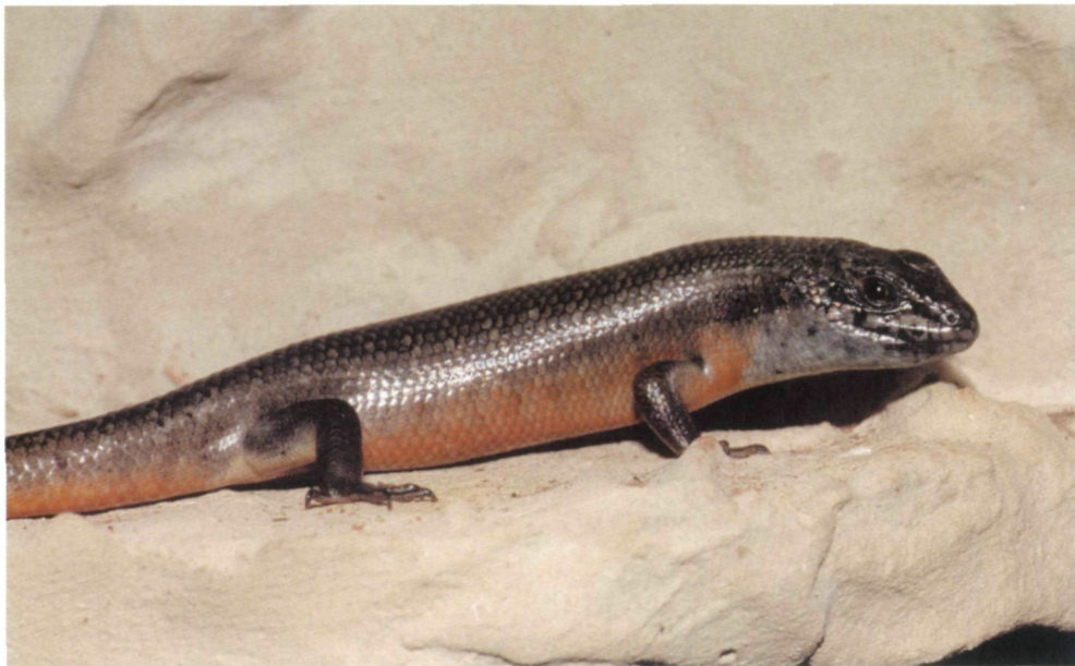
Fig. 1: Holotype of Trachylepis dichroma sp. nov. in life.