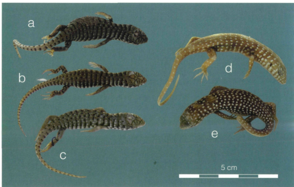
Fig. 8: Dorsal view of three preserved young of Trachylepis dichroma sp. nov. (a - ZMB 57531; b - ZMB 67019; c - ZMB 57532) and two preserved young of Trachylepis brevicollis (WIEGMANN, 1837) (d - ZMB 18301 from Kilimandjaro, Tanzania; e - ZMB 7088 from Keren, Eritrea) (Photo: N. HOFF).

Abb. 7: Wenige Tage altes Jungtier von Trachylepis dichroma sp. nov.