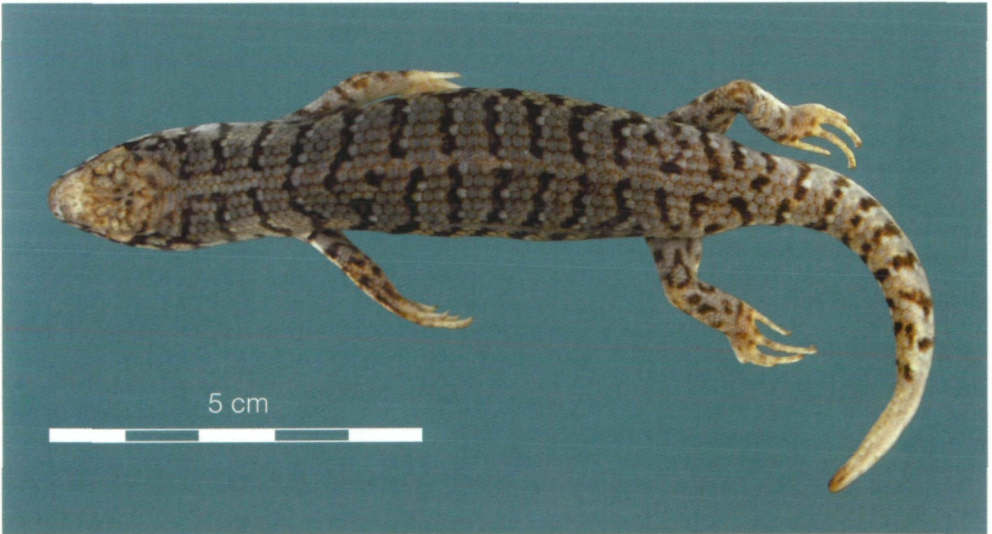
Fig. 6: Younger female of Trachylepis dichroma sp. nov. (ZMB 61836), in which the cross banding reaches nearly to the centre of the back.

Abb. 5: Zwei Weibchen von Trachylepis dichroma sp. nov. mit deutlicher Querbänderung an Kopf und Vorderkörper.