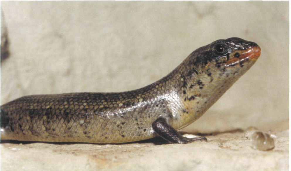
Fig. 4: Lateral view of the female paratype (ZMB 67017) of Trachylepis dichroma sp. nov. in life.

Abb. 3: Lebendfärbung der Unterseite eines Männchens von Trachylepis dichroma sp. nov. (Holotypus, oben) im Vergleich zur Lebendfärbung der Unterseite eines Weibchens (Paratypus ZMB 67017, unten).