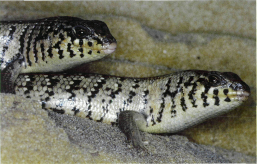
Fig. 5: Two females of Trachylepis dichroma sp. nov. with distinct cross banding of the head and anterior body.

Abb. 5: Zwei Weibchen von Trachylepis dichroma sp. nov. mit deutlicher Querbänderung an Kopf und Vorderkörper.