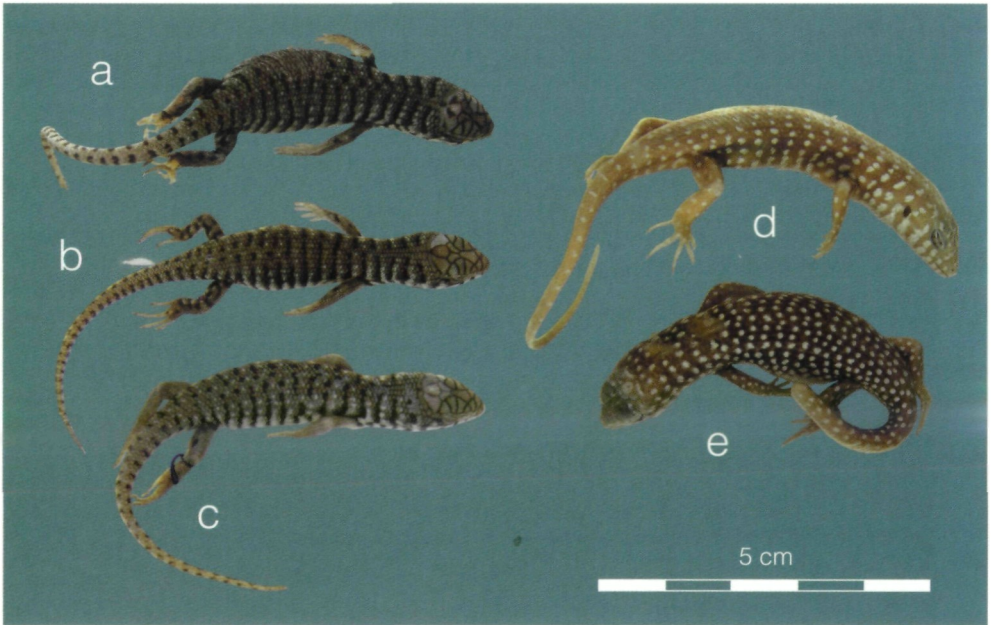
Fig. 8: Dorsal view of three preserved young of Trachylepis dichroma sp. nov. (a - ZMB 57531; b - ZMB 67019; c - ZMB 57532) and two preserved young of Trachylepis brevicollis (WIEGMANN, 1837) (d - ZMB 18301 from Kilimandjaro, Tanzania; e - ZMB 7088 from Keren, Eritrea).