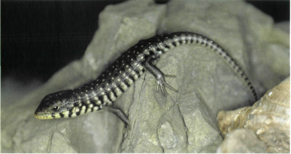
Fig. 7: A few days old specimen of Trachylepis dichroma sp. nov. (Photo: P. HARBIG). Abb. 7: Wenige Tage altes Jungtier von Trachylepis dichroma sp. nov.