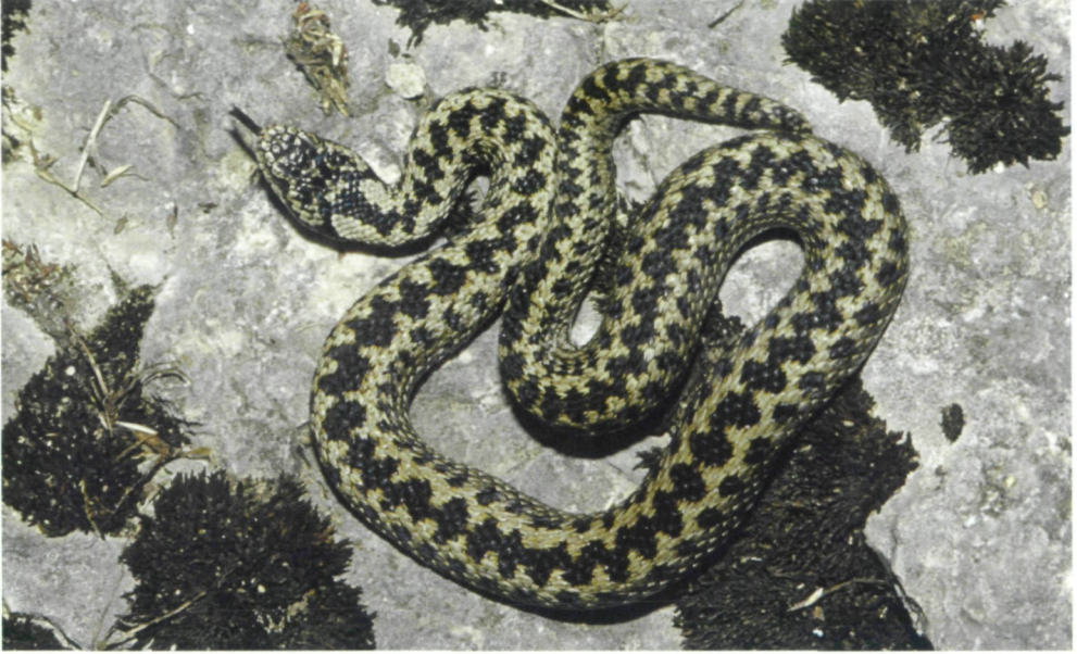
Fig. 1: Adult male Vipera darevskii VEDMEDERJA, ORLOV & TUNIYEV, 1986 from Zekeriya, Turkey (MNHN 2002.410).