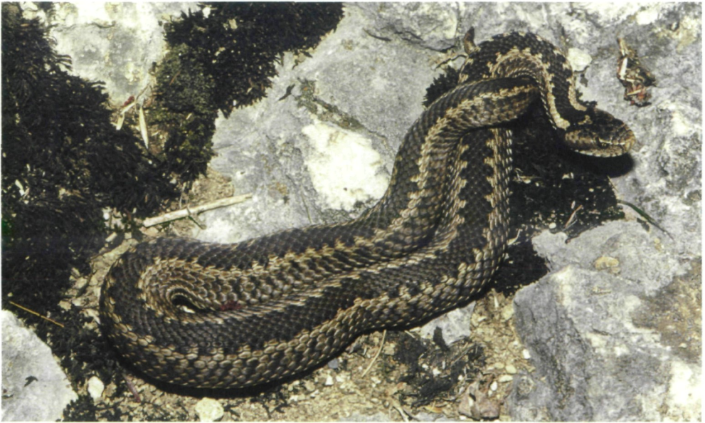
Fig. 2: Adult female Vipera darevskii VEDMEDERJA, ORLOV & TUNIYEV, 1986 from Zekeriya, Turkey (ASHNAO.00102).