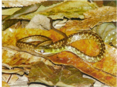
Fig. 2: Dendrophidion bivittatus (DUMÉRIL, BIBRON & DUMÉRIL, 1854) (FHGO 5461) from Ecuador.

Color in life (Fig. 2): Dorsum ground color yellowish brown with numerous oblique dark brown bars, separated from each other by 1 to 2 scales paralleling the dorsal scale rows. In the vertebral region, the