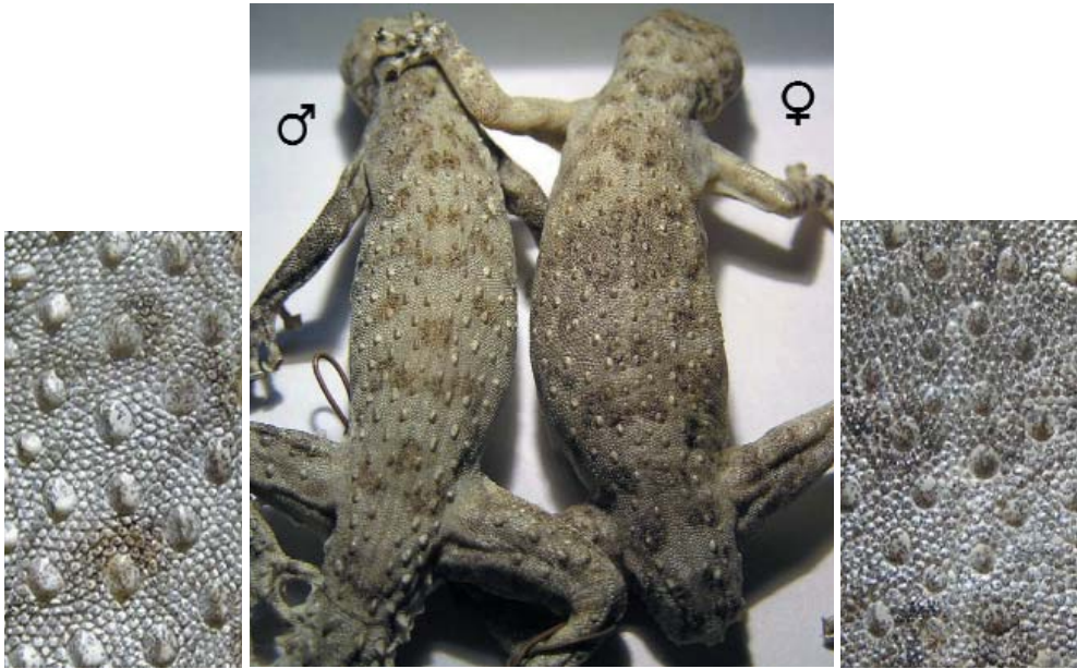
Fig. 1: Keeling of the tubercular scales in Asaccus kurdistanensis RASTEGAR-POUYANI, NILSON & FAIZI, 2006 from the region of Palangan, western Iran. Dorsal aspect and middorsal details of male (left) and female (right) integument.