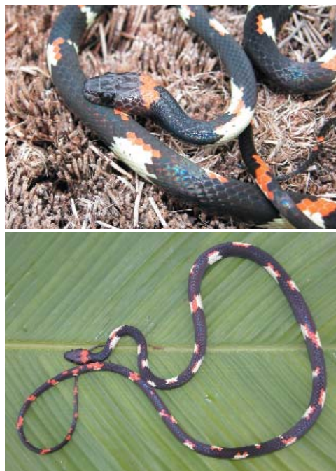
Fig. 2: Siphlophis worontzowi (PRADO, 1940) (NMP6V 73610) from Palmira, Departamento Pando, Bolivia. Portrait (above) and total view (below).

species: 15 rows of dorsals, red above, with black cross-bars (see BOULENGER 1902) and appears to be another specimen of S. worontzowi . Therefore, this record indicates that the range of S. worontzowi extends into Peru.