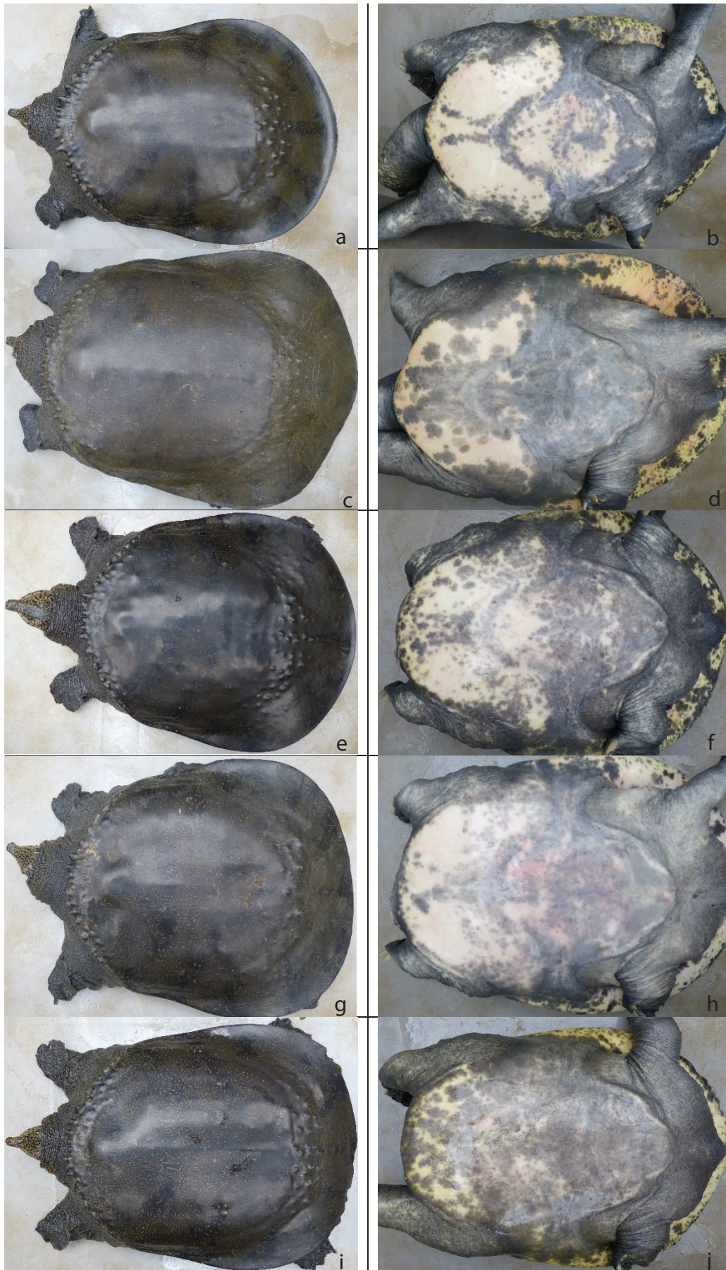
Figure 6. Paratypes, NHMW 41463:1 (a, b); NHMW 41463:2 (c, d); NHMW 41463:3 (e, f); NHMW 41463:4 (g, h); NHMW 41463:5 (i, j), living specimens of A. o. jongli ssp. nov. in the holdings of “Turtle Island”, dorsal and ventral view.