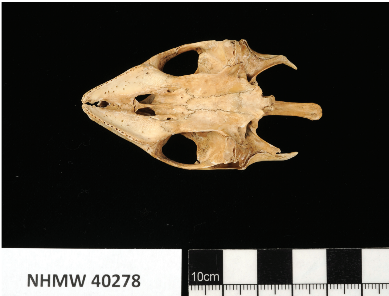
Figure 4. Holotype (NHMW 40278) of A. o. jongli ssp. nov. Skull in ventral view.

Amyda o. phayrei differs from the other two subspecies by its dull brown carapace, yellow pigments present forming distinct yellow dots on the head and neck; carapace with or without distinct saddle-shaped dark colouration; with eyes open, the eyelids have distinct yellow spots alternating with grey “zebra striped” colouration; tubercles in the nuchal and back region of the carapace but not as distinct as in A. o. jongli ssp. nov.; head in upper side view more slender and narrowed to the pro-