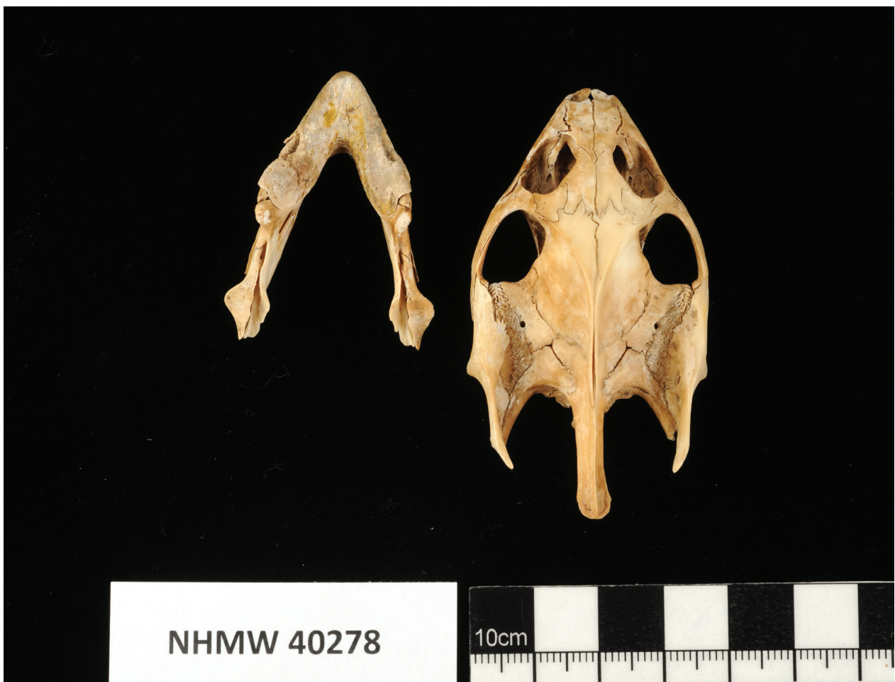
Figure 3. Holotype (NHMW 40278) of A. o. jongli ssp. nov. Lower jaw (dorsal with alveolar surface of mandible) and skull (dorsal).