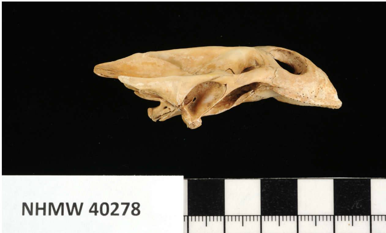
Figure 5. Holotype (NHMW 40278) of A. o. jongli ssp. nov. Skull in lateral view. Note the convex structure of frontal, prefrontal and maxillary.

on the back and missing “ocelli” on carapace similar to A. c. maculosa . It strongly resembles A. o. jongli ssp. nov. concerning faded dots and vermiculation on head and neck too, but was tentatively assigned to A. o. phayrei by Fritz et al. (2014) mainly on zoogeographical reasons. However, its identity remains doubtful.