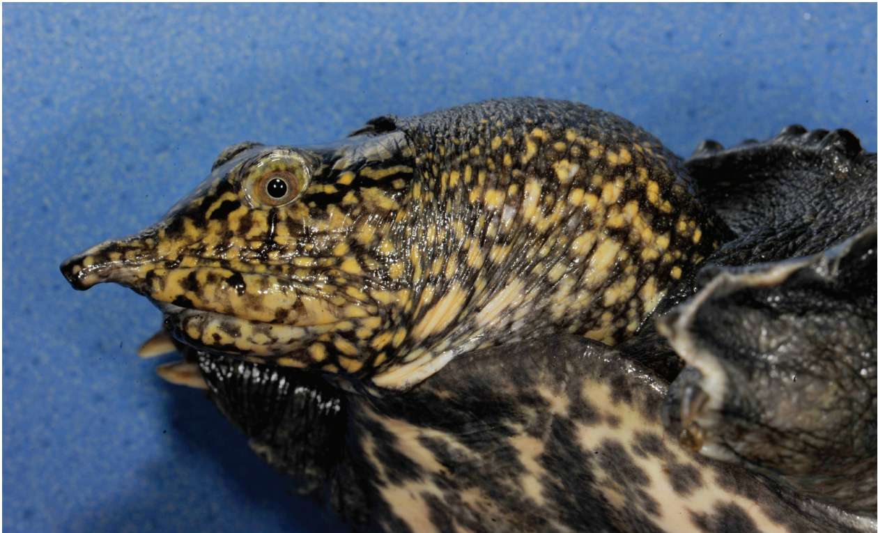
Figure 9. Lateral shot of the head of a living A. o. jongli ssp. nov. showing the ochre-coloured eyes and the shape of the head.