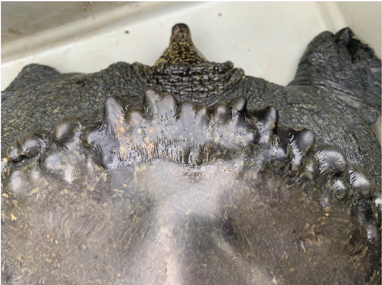
Figure 8. Tubercles are visible, protruding over the front of the carapace in the nuchal and back region in subadult and adult animals.

The Sangu River flows through Myanmar and Bangladesh, its source is in the North Arakan Hills of Myanmar and forms the boundary between Arakan and the Chittagong Hill Tracts. It follows a northerly circuitous course in the hill tracts and then enters Bangladesh near Remarki, Thanchi Upazila, Bandarban District, from the east. It flows north through Thanchi, Rowangchari and Bandarban Sadar Upazilas of Bandarban District. It then flows west through Satkania and Banshkali Upazilas in Chittagong District and flows into the Bay of Bengal near Chittagong, about 16 kilometres south of the mouth of the Karnaphuli River. Sangu drains off the waters of Patiya, Satkania, and Banshkhali Upazilas and has a connection with the Karnaphuli River through the Chand Khali River. A. o. jongli ssp. nov. has not been recorded in the Karnaphuli River. The Sangu is a shallow river, but it becomes violent during rains and develops rapid currents. Thus, the Sangu River System, along with the Karnaphuli River, form a river system that is neither connected in the north to the Brahmaputra, nor in the south to the Irrawaddy River system.