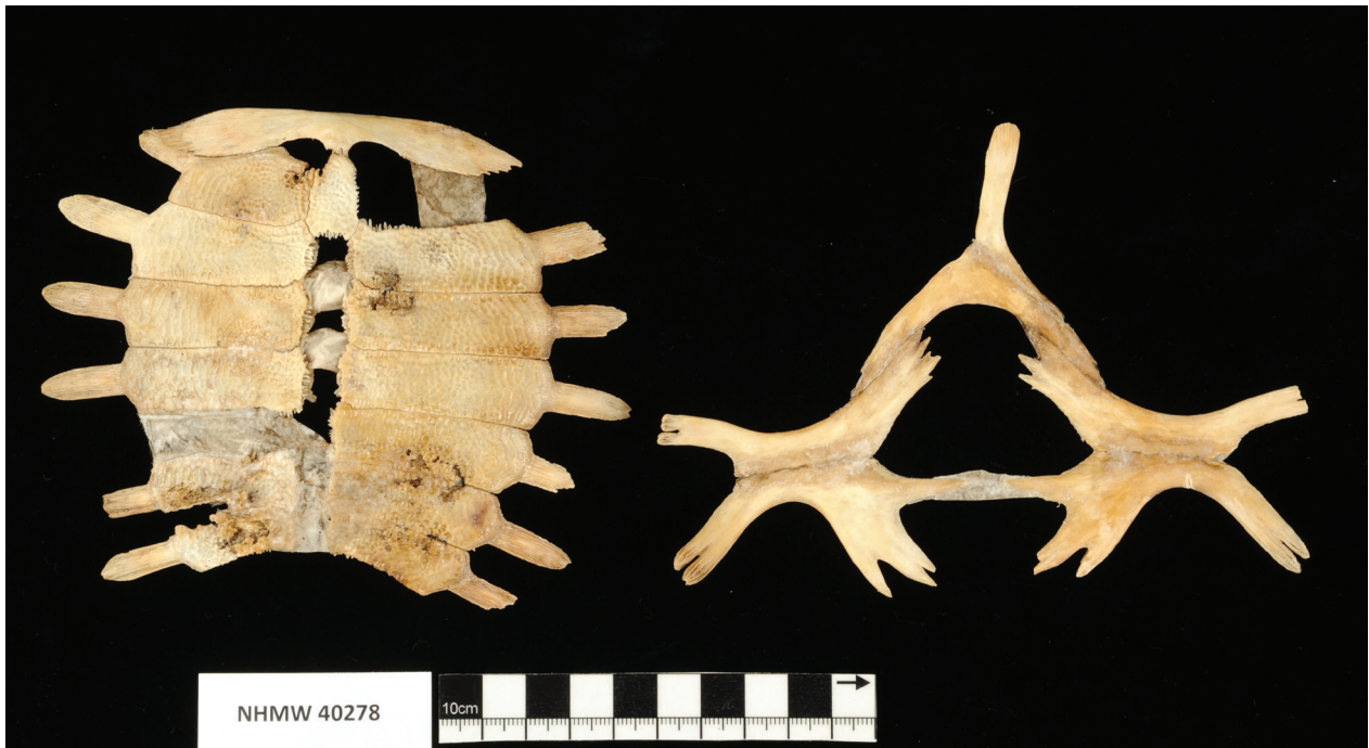
Figure 2. Holotype (NHMW 40278) of A. o. jongli ssp. nov. Bony elements of carapace (dorsal) and plastron (dorsal/visceral). Some neurals, 1 st pleural right, left epiplastron and xiphiplastra missing.