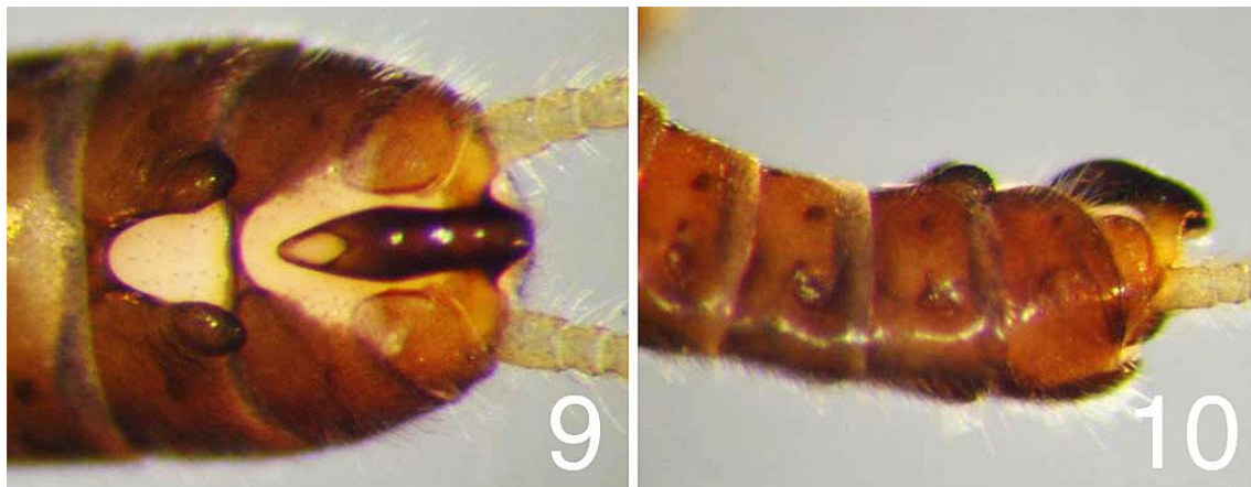
Figs. 9-10. Capnia umpqua , adult male, color photographs, South Fork Stony Creek, California. 9. male terminalia, dorsal; 10. male terminalia, lateral.