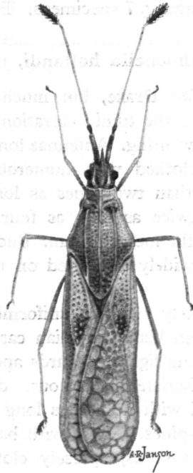
Fig. 2. Camplotingis tantilla , n. sp. (Type).

Elytra longer than abdomen, broadly rounded at apex, slightly constricted behind middle; costal area carina-like, without areolae; subcostal area, narrow, mostly biseriata, triseriate at widest part;