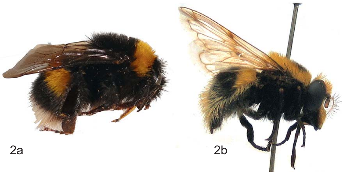
Fig 2: (a) B. terrestris queen and (b) adult fly of V. bombylans .