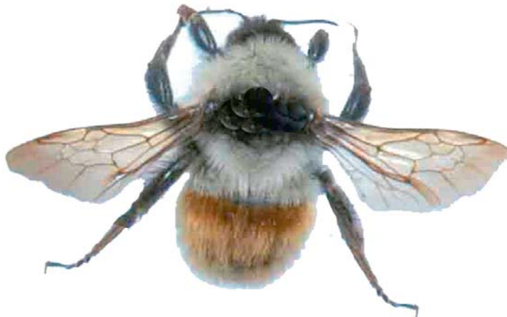
Fig. 4: B. mesomelas queen (all casts have the same colour pattern in Iran).