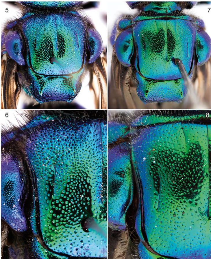
Figs 5–8: Mesosomal dorsa of males of Exaerete tricoso sp. n. and E. trochanterica (FRIESE). 5: Mesosomal dorsum of E. tricoso sp. n. 6: Detail of mesoscutum of E. tricoso sp. n. 7: Mesosomal dorsum of E. trochanterica . 8: Detail of mesoscutum of E. trochanterica .

antennal toruli, in ocellular area, and on vertex posterior to lateral ocellus; vertex and gena with punctures similar to those of face except separated by 0.25–1× a puncture width on vertex and on upper and posterior portions of gena, punctures on lower anterior portion of gena smaller and denser, nearly contiguous in places; postgena with punctures similar to those of lower posterior gena except coarser. Pronotum with coarse, contiguous punctures on dorsalfacing surface bordering mesoscutum except medially where punctures become minute and more widely spaced, integument between