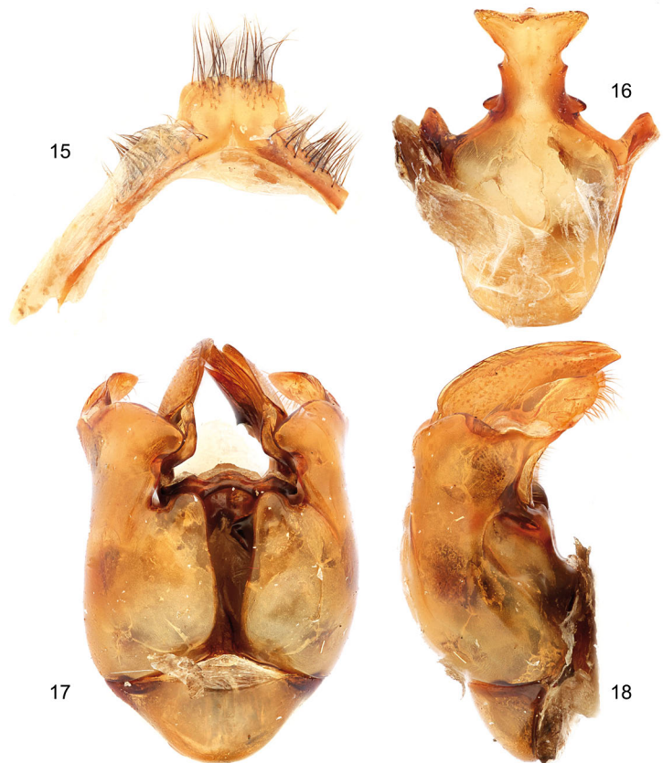
Figs 15–18: Male terminalia of Exaerete tricosus sp. n. 15: Sternum VII. 16: Sternum VIII. 17: Dorsal view of genital capsule. 18: Lateral view of genital capsule.

Remarks. Specimens of the trochanterica species group are rather uncommon in collections and it is therefore difficult to assess what degree of phenotypic variation may exist within each of the known species, particularly as we lack series across numerous potential geographical regions within putative ranges. Nonetheless, genitalic differences among the species of this group are distinctive and, based on known variations in other groups of the genus (as well as elsewhere among Euglossini ), there is no reason to believe that such unique forms are indicative of good species. Accordingly, based on examination of the available series hitherto known, the combination of traits outlined above for the present new species are