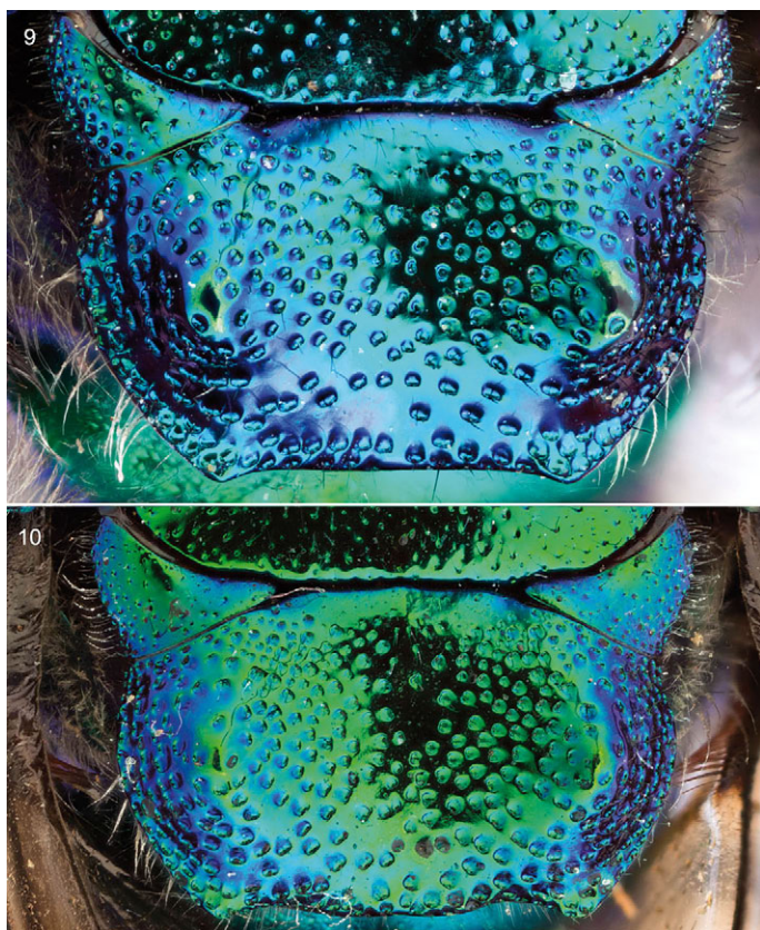
Figs 9-10: Mesoscutella of males of Exaerete tricosa sp. n. and E. trochanterica (FRIESE). 9: Mesoscutellum of E. tricosa sp. n. 10: Mesoscutellum of E. trochanterica

between punctures shining and smooth. Metanotum declivitous, minutely imbricate and with faint, minute punctures at least basally. Mesepisternum with large punctures separated by less than a puncture width, nearly contiguous in some places, punctures more drawn out and weaker posteriorly along border with metepisternum, punctures becoming more widely spaced ventrally, integument between punctures smooth and shining; hypopleural area with small to minute punctures separated by 0.5\text{--}1.5\times a puncture width, punctures more spaced along borders, particularly medioventral lip, integument between puncture smooth and shining; metepisternum with small punctures separated by 0.5\text{--}1\times a puncture width dorsally separated from minute, nearly contiguous punctures ventrally by a large,