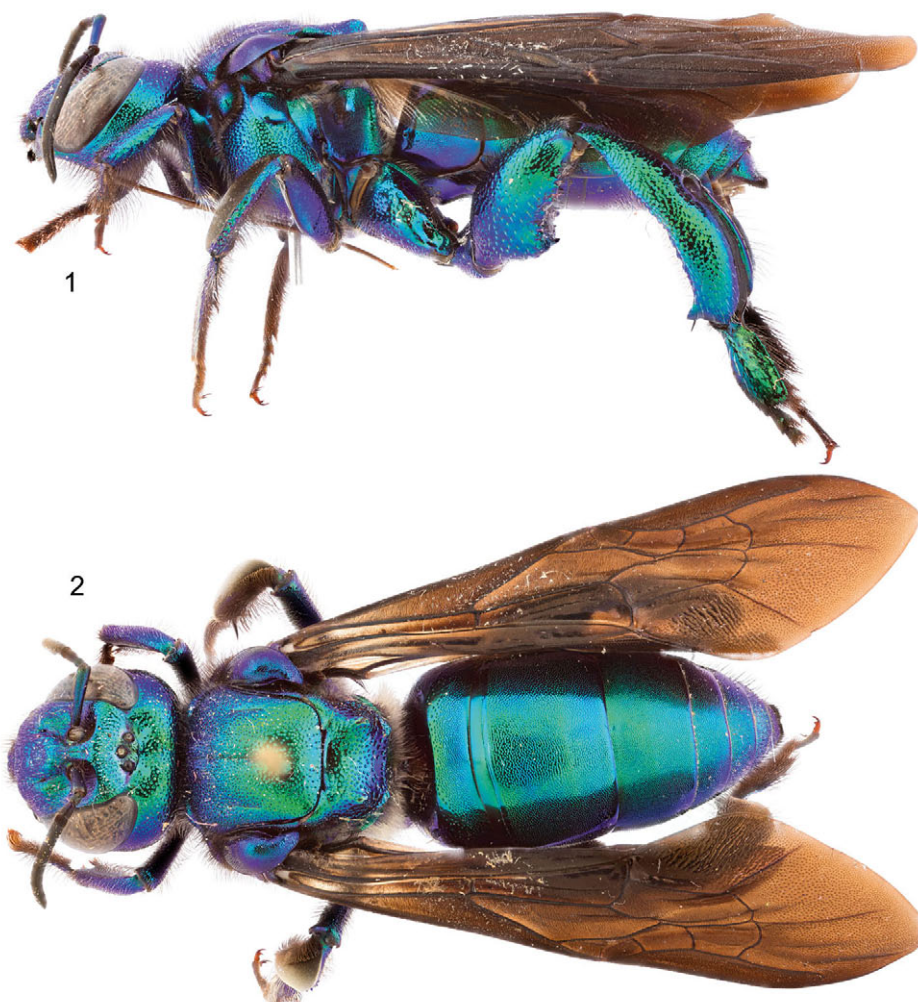
Figs 1-2: Holotype male of Exaerete tricosa sp. n. 1: Lateral habitus. 2: Dorsal habitus.