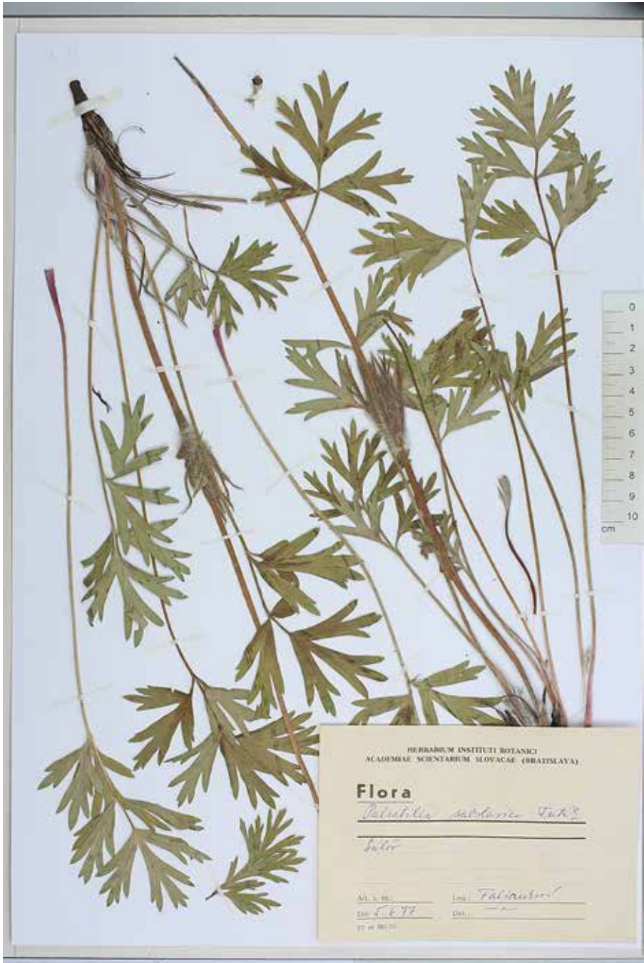
Fig. 9: Herbarium specimens of vegetative Pulsatilla styriaca (“ P. subslavica ”) from Slovakia (SAV). — Abb. 9: Herbarbelege von vegetativen Pulsatilla styriaca (“ P. subslavica ”) aus der Slowakei (SAV).