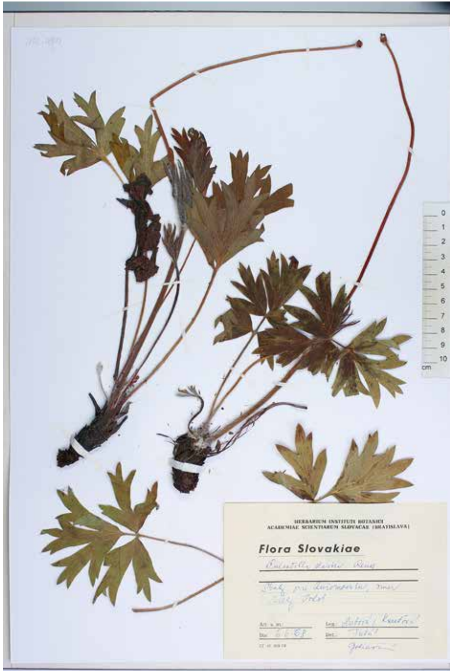
Fig. 5: Herbarium specimen of fruiting Pulsatilla slavica from Slovakia, leg. Hubová, Kmětová and Futák (SAV). — Abb. 5: Herbarbeleg einer fruchtenden Pulsatilla slavica aus der Slowakei, leg. Hubová, Kmětová and Futák (SAV).