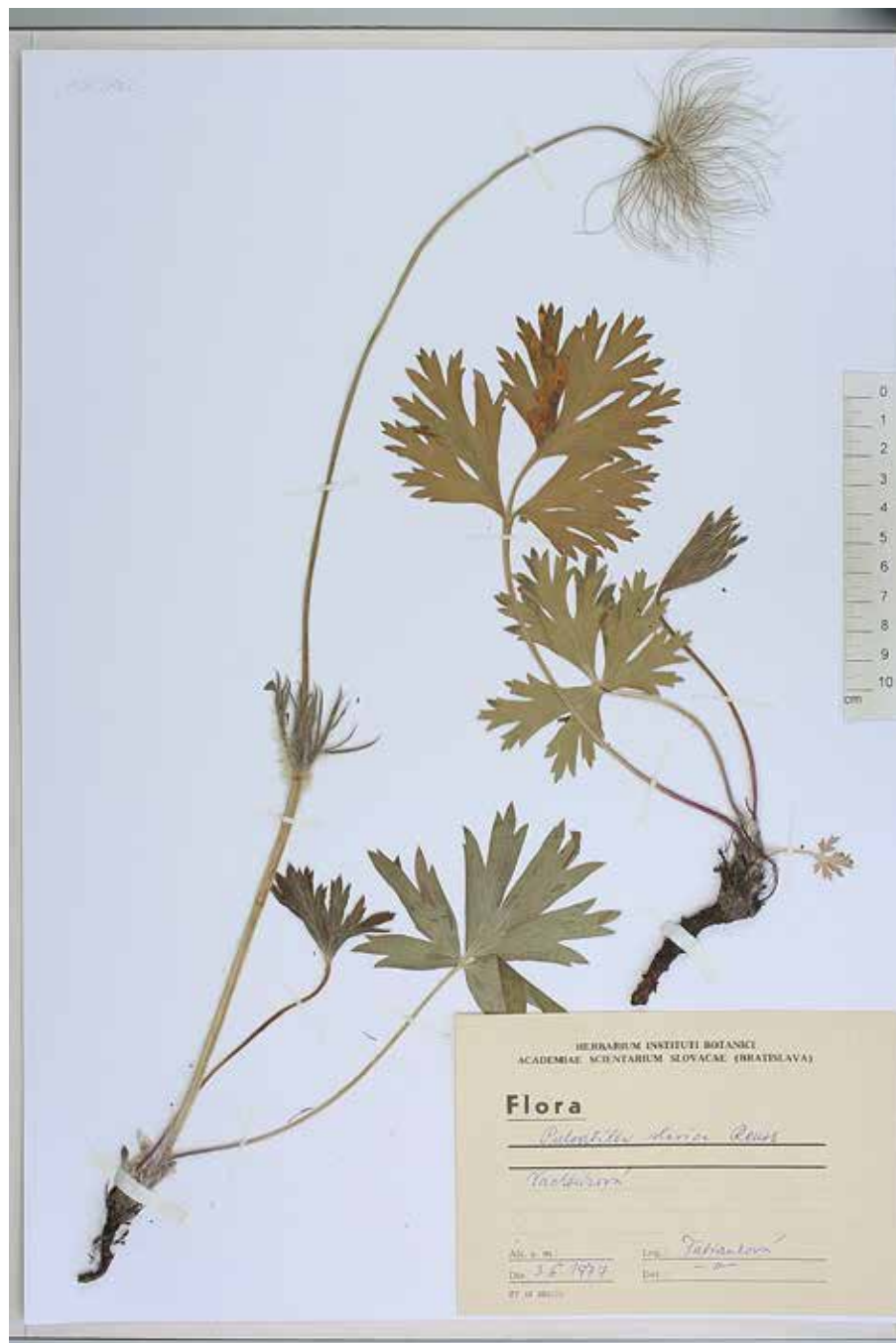
Fig. 7: Herbarium specimen of fruiting Pulsatilla slavica from Slovakia, leg. Fabianková (SAV). — Abb. 7: Herbarbeleg einer fruchtenden Pulsatilla slavica aus der Slowakei, leg. Fabianková (SAV).