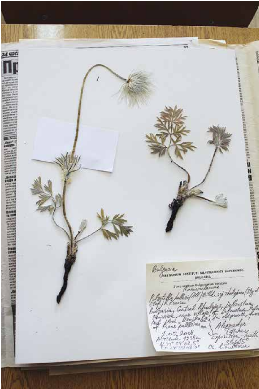
Fig. 13: Herbarium specimen of Pulsatilla rhodopaea from the central Rhodopes in Bulgaria, near the village Dobrostan, Pinus pallasiana forest, 1235 m a. s. l., A. Tashev, 1 May 2008. — Abb. 13: Herbarbeleg der Pulsatilla rhodopaea aus den Zentral-Rhodopen (Bulgarien), nächst dem Dorf Dobrostan, Pinus pallasiana -Wald, 1235 msm, A. Tashev, 1. Mai 2008.