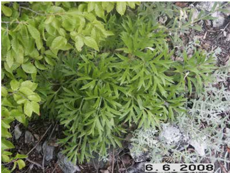
Fig. 15: Specimen of Pulsatilla styriaca with fully developed leaves close to a tree of Ostrya carpinifolia ; western Sredna Gora; A. Tashev, 6 June 2008. — Abb. 15: Exemplar der Pulsatilla styriaca mit voll entwickelten Laubblättern, neben einer Hopfenbuche ( Ostrya carpinifolia ); westliches Balkan-Gebirge; A. Tashev, 6. Juni 2008.