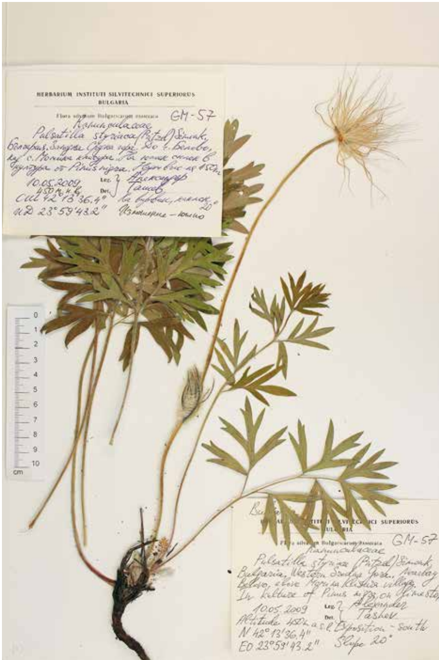
Fig. 16: Herbarium specimen of fruiting Pulsatilla styriaca from western Sredna Gora in Bulgaria, near Belovo, 450 m a. s. l.; A. Tashev, 10 May 2009. — Abb. 16: Herbarbeleg einer fruchtenden Pulsatilla styriaca vom westlichen Balkan-Gebirge, bei Belovo, 450 m s. m.; A. Tashev, 10. Mai 2009.