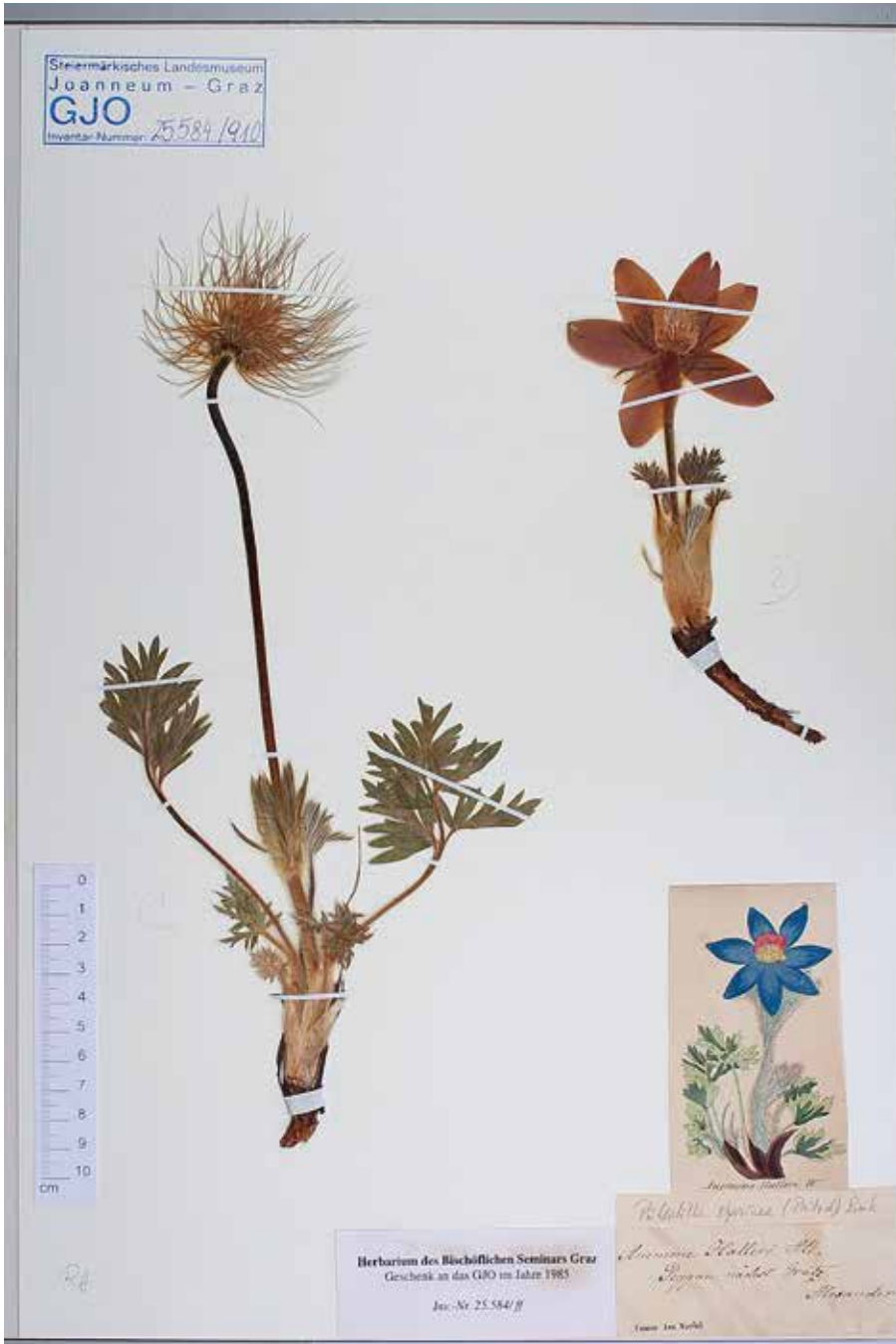
Fig. 4: Herbarium specimens of flowering and fruiting Pulsatilla styriaca from Styria (Austria), Peggau (GJO). — Abb. 4: Herbarbelege blühender und fruchtender Pulsatilla styriaca aus der Steiermark (Österreich), Peggau (GJO).