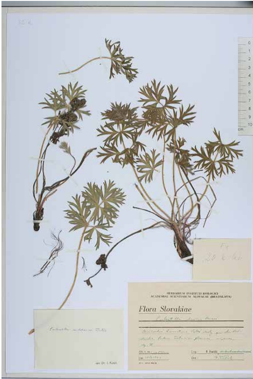
Fig. 10: Herbarium specimens of vegetative Pulsatilla styriaca (“ P. subslavica ”) from Slovakia, from the same locality as the specimen in Fig. 14, but with narrower leaf segments, leg. & det. as P. slavica , later rev. as P. subslavica by J. Futák (SAV). — Abb. 10: Herbarbelege von vegetativen Pulsatilla styriaca (“ P. subslavica ”) aus der Slowakei, von derselben Fundstelle wie das Exemplar in Abb. 14, aber mit schmälere Laubblattabschnitten, leg. & det. als P. slavica , später rev. als P. subslavica von J. Futák (SAV).