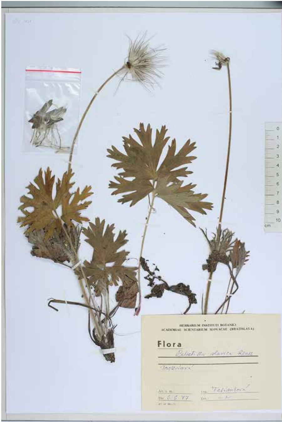
Fig. 6: Herbarium specimen of fruiting Pulsatilla slavica from Slovakia, leg. Fabianková (SAV). — Abb. 6: Herbarbeleg einer fruchtenden Pulsatilla slavica aus der Slowakei, leg. Fabianková (SAV).