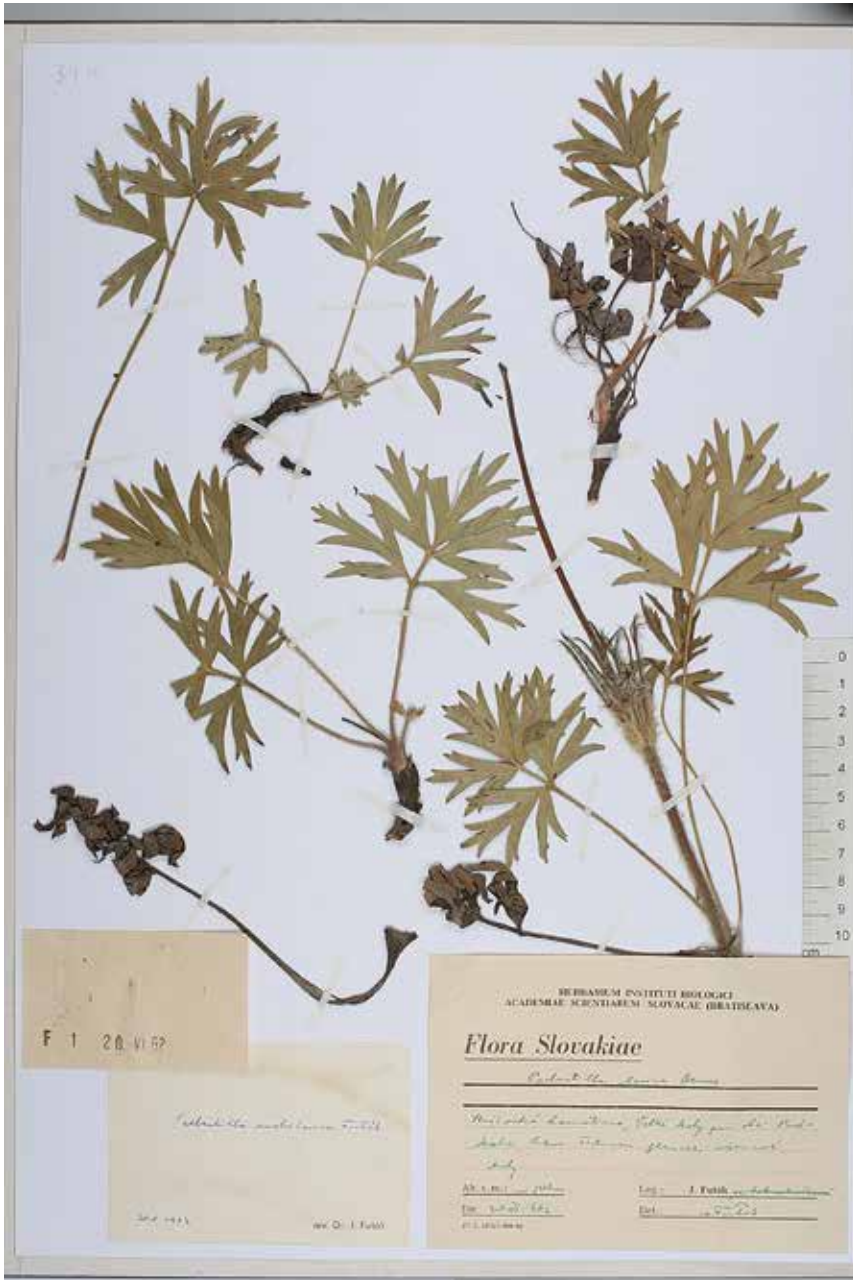
Fig. 11: Herbarium specimens of vegetative Pulsatilla styriaca (" P. subslavica ") from Slovakia, from the same locality as specimens in Fig. 13, but with wider leaf segments, leg. & det. as P. slavica , later rev. as P. subslavica by J. Futák (SAV). — Abb. 11: Herbarbelege von vegetativen Pulsatilla styriaca (" P. subslavica ") aus der Slowakei, von derselben Fundstelle wie die Exemplare in Abb. 13, aber mit breiteren Laubblattabschnitten, leg. & det. als P. slavica , später rev. als P. subslavica von J. Futák (SAV).