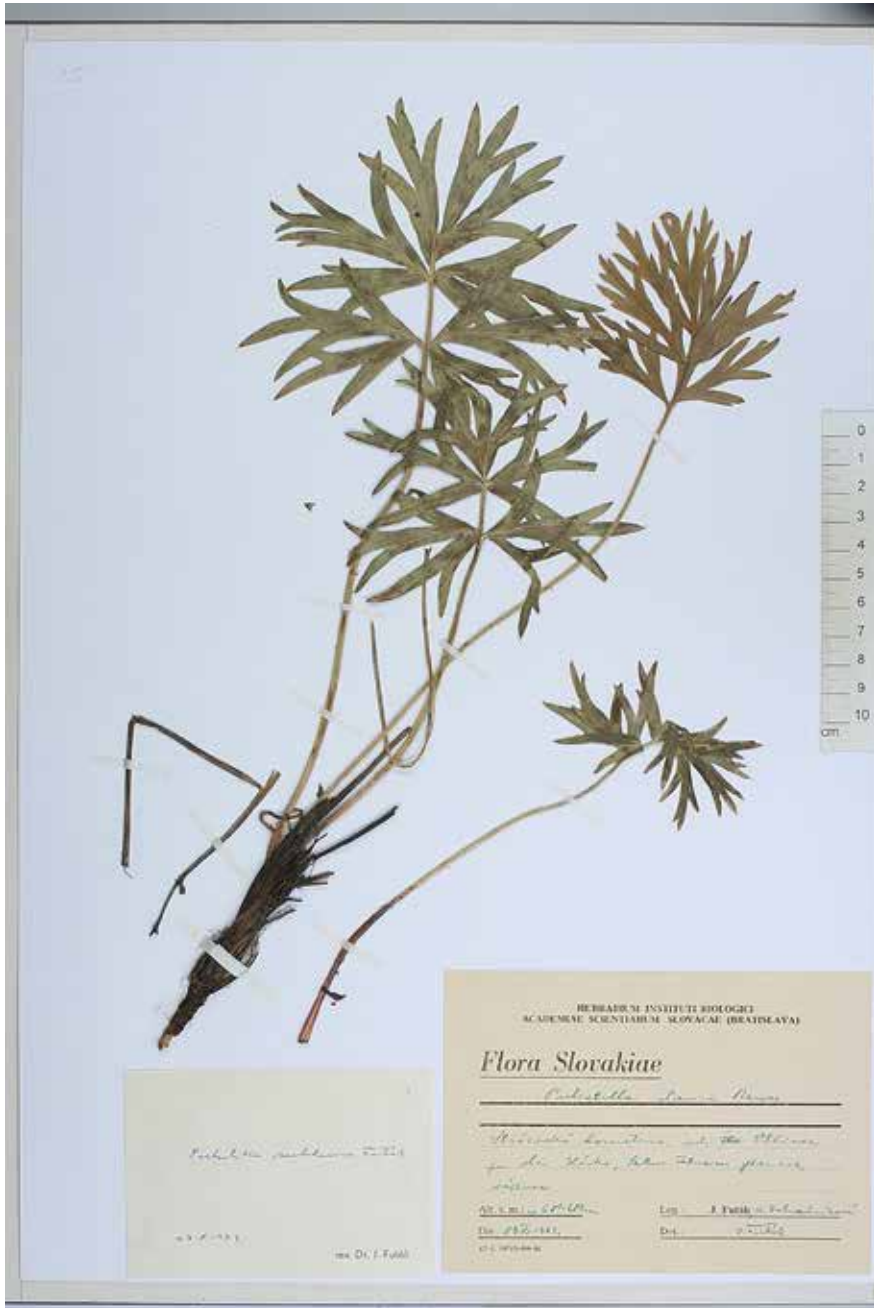
Fig. 8: Herbarium specimen of a vegetative Pulsatilla styriaca (“ P. subslavica ”) from Slovakia, leg. & det. as P. slavica , later rev. as P. subslavica by J. Futák (SAV). — Abb. 8: Herbarbeleg einer vegetativen Pulsatilla styriaca (“ P. subslavica ”) aus der Slowakei, leg. & det. als P. slavica , später rev. als P. subslavica von J. Futák (SAV).