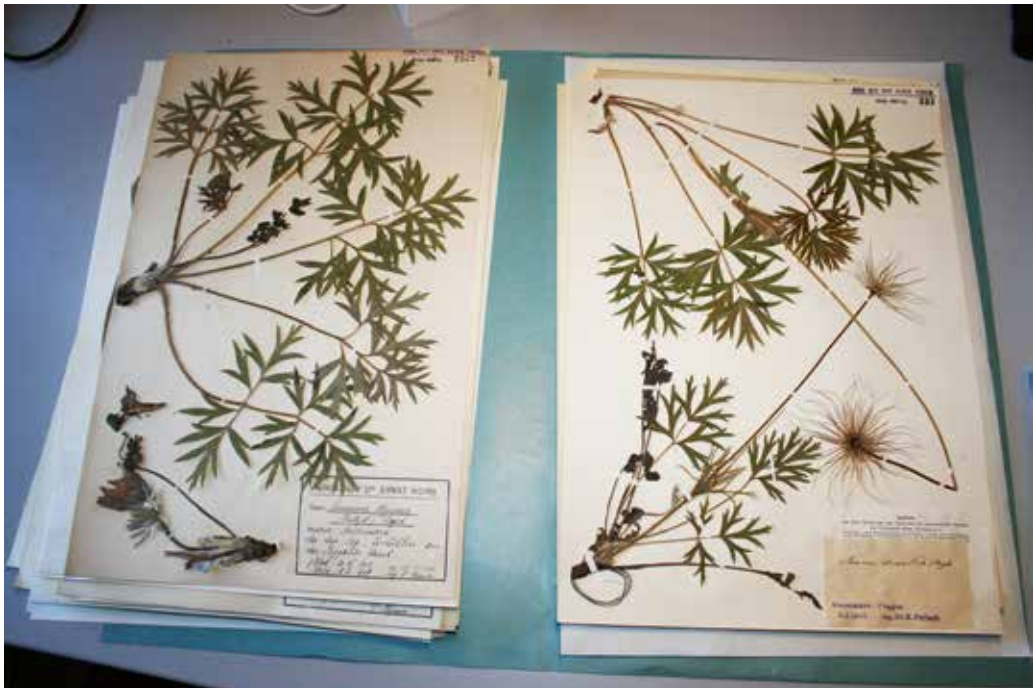
Fig. 1: Herbarium specimens of fruiting Pulsatilla styriaca from Styria (Austria), Peggauer Wand N of Graz, leg. E. Korb, 20 June 1908, and leg. K. Fritsch, 3 June 1902 (W). — Abb. 1: Herbarbelege von fruchtenden Pulsatilla styriaca aus der Steiermark (Österreich), Peggauer Wand N von Graz, leg. E. Korb, 20. Juni 1908 und leg. K. Fritsch, 3. Juni 1902 (W).