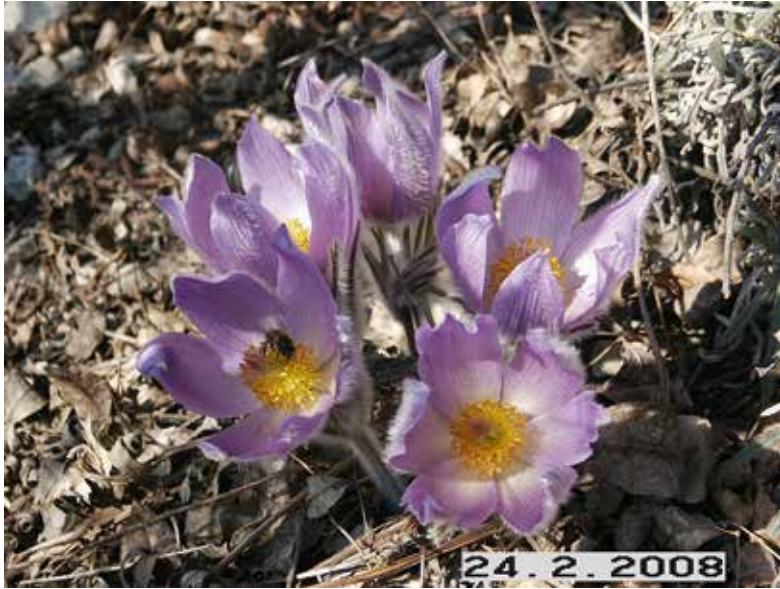
Fig. 14: Flowers of Pulsatilla styriaca in western Sredna Gora; A. Tashev, 24 Feb. 2008. — Abb. 14: Blühendes Individuum von Pulsatilla styriaca im westlichen Balkan-Gebirge; A. Tashev, 24. Feb. 2008.