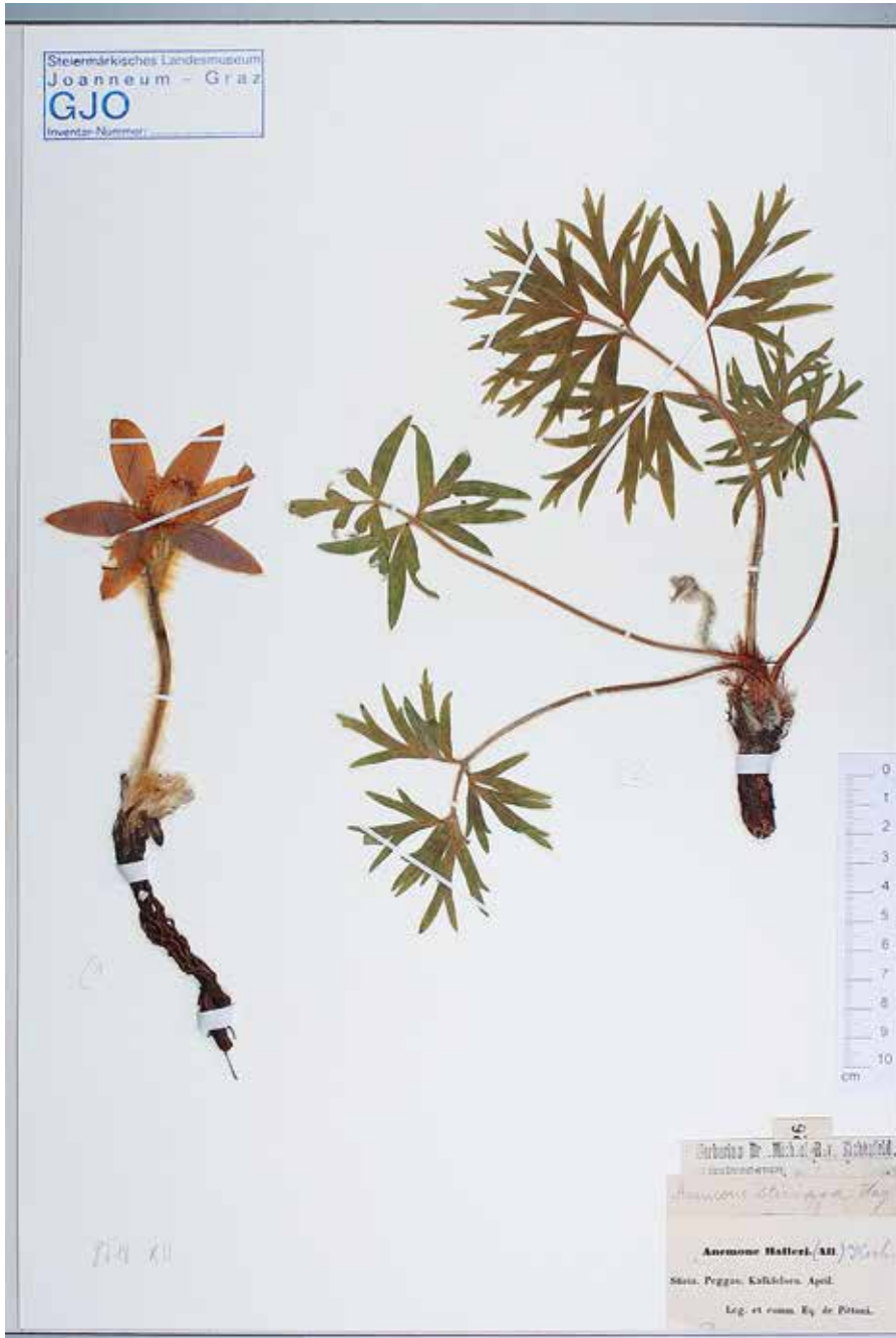
Fig. 2: Herbarium specimens of flowering and vegetative Pulsatilla styriaca from Styria (Austria), near Peggau, leg. Eu. v. Pittoni (GJO). — Abb. 2: Herbarbelege einer blühenden und einer vegetativen Pulsatilla styriaca aus der Steiermark (Österreich), bei Peggau, leg. Eu. v. Pittoni (GJO).