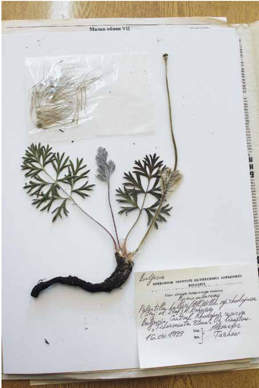
Fig. 12: Herbarium specimen of fruiting Pulsatilla rhodopaea from the central Rhodopes in Bulgaria, reserve “Červenata stena” [The Red Wall], A. Tashev, 16 Apr. 1999. — Abb. 12: Herbarbeleg einer fruchtenden Pulsatilla rhodopaea aus den Zentralrhodopen (Bulgarien), Schutzgebiet “Červenata stena” [Rote Wand], A. Tashev, 16. April 1999.