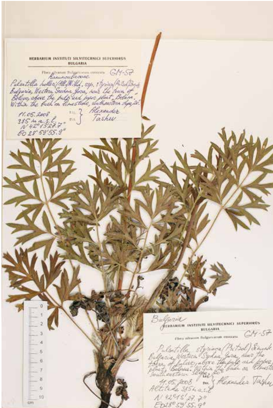
Fig. 17: Herbarium specimen of fruiting Pulsatilla styriaca from western Sredna Gora in Bulgaria, near Belovo, 385 m a. s. l.; A. Tashev, 11 May 2009. — Abb. 17: Herbarbeleg einer fruchtenden Pulsatilla styriaca vom westlichen Balkan-Gebirge, bei Belovo, 385 m s. m.; A. Tashev, 11. Mai 2009.