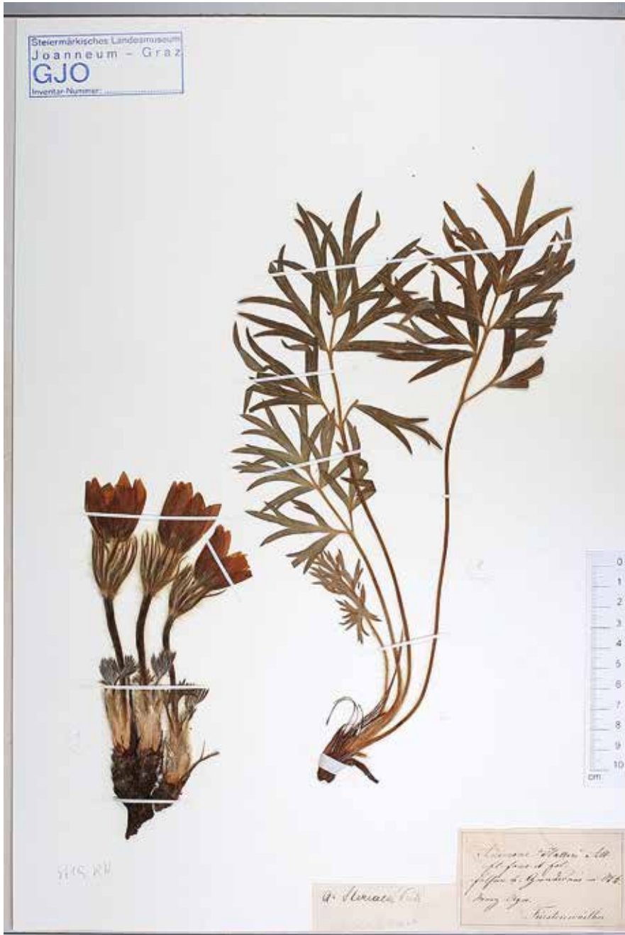
Fig. 3: Herbarium specimen of flowering and postfloral Pulsatilla styriaca from Styria (Austria), rocks near Gratwein, leg. Fürstenwärther (GJO). — Abb. 3: Herbarbelege eines blühenden und eines postfloralen Exemplars der Pulsatilla styriaca aus der Steiermark (Österreich), Felsen bei Gratwein, leg. Fürstenwärther (GJO).