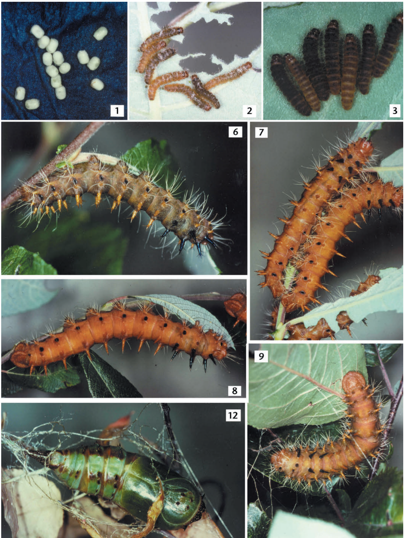
Colour Plates 1 & 2: Pseudantheraea discrepans . Cameroon. Fig. 1: ova. Fig. 1: L 1 . Fig. 3: L 2 . Fig. 4: L 3 . Fig. 5: L 4 . Fig. 6: L 5 . Fig. 7: L 6 . Fig. 8: L 7 . Figs. 9, 10: Praepupa spinning flimsy cocoon and shortly before pupation moult in cocoon. Fig. 11: Fresh pupa with larval skin. Fig. 12: Pupa in very flimsy cocoon. Caused by wind and movements of the food plant, the pupa may easily fall out of these few silken strands and then will hang freely in the plant, head down, held by the cremaster hooks in a silk bolster. Fig. 13: Pupa out of cocoon; see silk in cremastral hooks. Figs. 14, 15: Imagines, Fig. 14 ♂, Fig. 15 ♀.