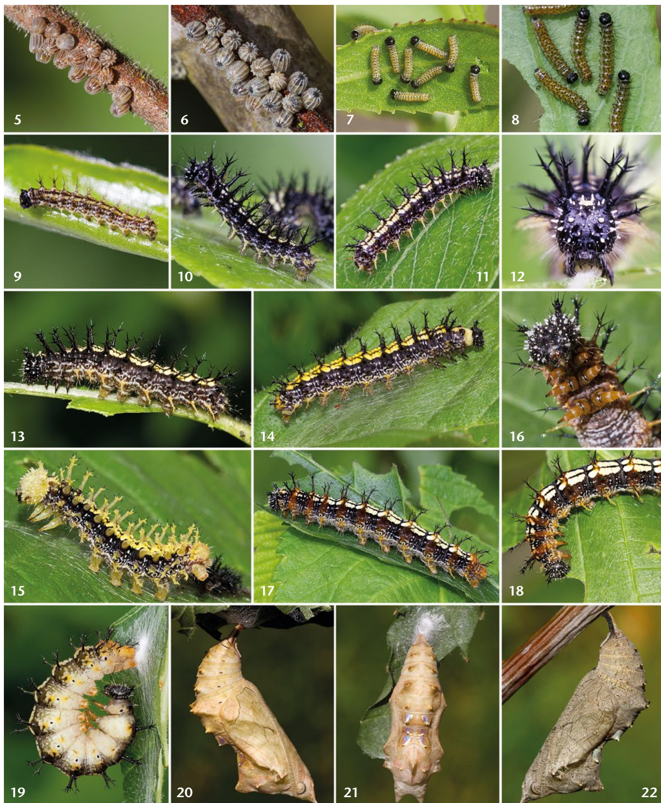
Plate 2, Figs. 5–22: N. vaualbum from Stara Planina, Zaječar, Serbia. Fig. 5: Ova, 3. iv. 2012. Fig. 6: Ova (near hatching), 5. iv. 2012. Fig. 7: L 1 (one-day old) larvae on Salix daphnoides , 6. iv. 2012. Fig. 8: L 1 , 3.5 mm larvae, 9. iv. 2012. Figs. 9: L 2 , 6 mm larvae, 15. iv. 2012. Fig. 10: L 3 , 10 mm larva posturing, 19. iv. 2012. Fig. 11: L 3 , 12 mm larva, 21. iv. 2012. Fig. 12: L 4 head capsule detail, 1. v. 2012. Fig. 13: L 4 , 19 mm larva, 1. v. 2012. Fig. 14: L 4 , 24 mm larva skin changing on Ulmus glabra , 10. v. 2012. Fig. 15: L 5 , 24 mm, yellow colouration after moult, 10. v. 2012. Fig. 16: Head detail, ventral view, of L 5 33 mm larva, 13. v. 2012. Figs. 17–18: L 5 , 40–42 mm larva, on Ulmus glabra , 17. v. 2012. Fig. 19: L 5 hanging up to pupate, 20. v. 2012. Figs. 20–21: Buff coloured 26 mm pupa, 22. v. 2012. Fig. 22: Grey coloured 25 mm pupa, 22. v. 2012.