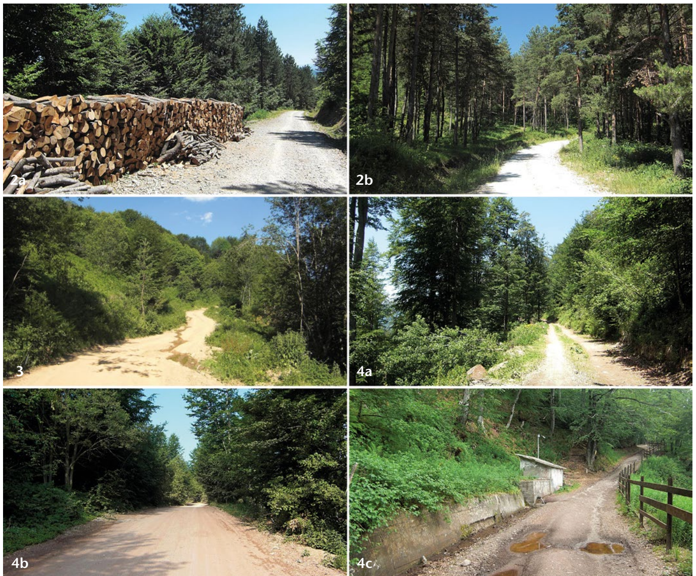
Plate 1, Figs. 2–4: Localities of N. vauualbum in Serbia. Figs. 2a–2b: Mt. Mučanj, Moravica, 19. vi. 2012. Fig. 3: Golija Biosphere Reserve, Moravica, 20. vi. 2012. Figs. 4a–4c: Babin Zub, Stara Planina, 23.–28. vi. 2012 — Photographs: MGP.

Between 22. vi. and 30. vi., various habitats in the Stara Planina region were surveyed (Figs. 4a–c). On 25. vi. a fresh specimen was observed flying along a woodland ride north of Janja at an altitude of 590 m. It was flitting between damp patches where other nymphalids were congregating, including: Argynnis paphia (LINNAEUS, 1758), Apatura ilia ([DENIS & SCHIFFERMÜLLER], 1775), Apatura