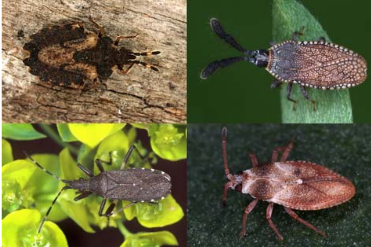
Figures 20-23: True bugs (Heteroptera): Aradus versicolor is fungicolous on beech-deadwood. Copium clavicorne is xerothermophilic and lives on Teucrium chamaedrys . Dicranocephalus medius ist xerothermophilic and lives on Euphorbia . Oncochila simplex can be found on Euphorbia cyparissias in warm and dry habitats.

Both plants and animals are known for using avalanche tracks as sliding transport corridors. Rockfalls seems to be a quite common, quick and frequent way of downhill transport for nests of eggs, juvenils and adults. This dangerous dispersal mechanism inside avalanche tracks offers the advantage that the arrival area contains a wide spectrum of different habitat types and microclimatic niches. Therefore the chance of finding suitable conditions is quite good to establish long-lasting populations. Furthermore, the valley-populations of these alpine species can count on a regular supply of new colonists from higher elevation habitats.