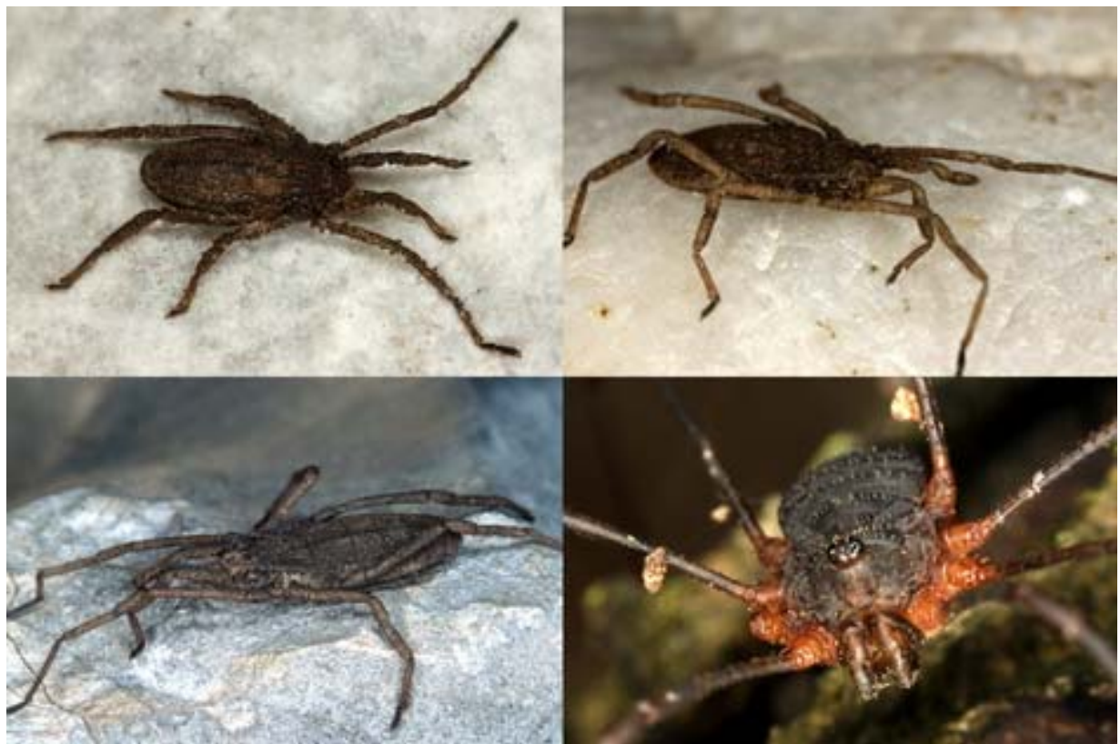
Figures 12-15: Harvestmen (Opiliones) of avalanche tracks in the Gesäuse: Trogulus tricarinatus , Trogulus nepaeformis , Trogulus tingiformis , Lacinius dentiger .

In total the species of mesophilic open grassland are dominant (32%); they are concentrated in the ruderal vegetation and the shrubby slope extensions with mainly eurytopic species. Further 30% of the species belong to the mesophilic edge- and forest species – witnesses of the diversity in structures and the tendency of forest-growth on the brim of the erosion tracks. One fourth of the species is xerothermophilic – a quite high value for an inneralpine montane locality. Remarkable is the well represented guild of xerophilic, epigeal bug species. Four (7%) montane-alpine species of open land complete this rich bug coenosis.