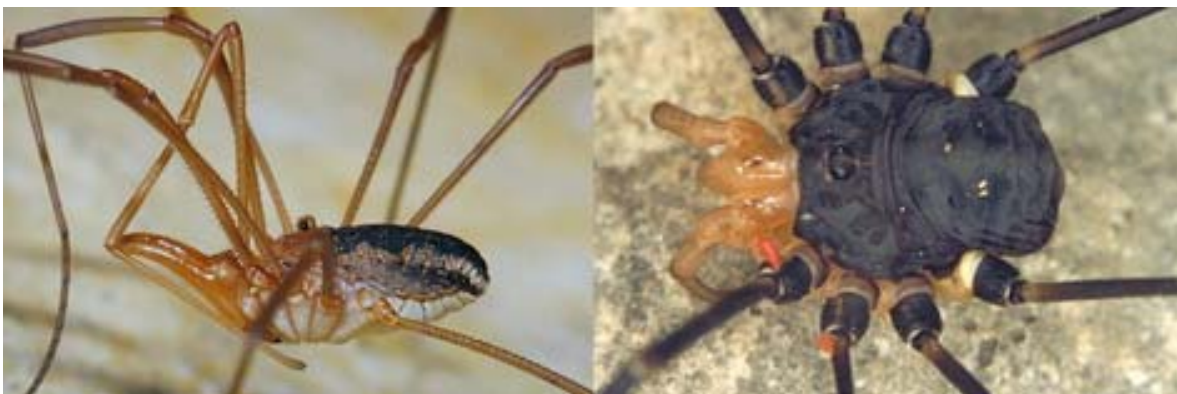
Figures 26-27: Side-by-side occurrence of the heliophilic harvestman (Opiliones) Phalangium opilio and the hygrophilous Gysa titanus – avalanche tracks offer suitable conditions for both.

Continuing scientific investigations are necessary. Representative and semi-quantitative data are urgently required to gain an overview of the whole species spectrum, coenoses and guilds. The application of pitfall-traps is essential to record the ombrophilous, hygrophilous, cold-adapted and crevice- and cave-species (KOMPOSCH 2010).