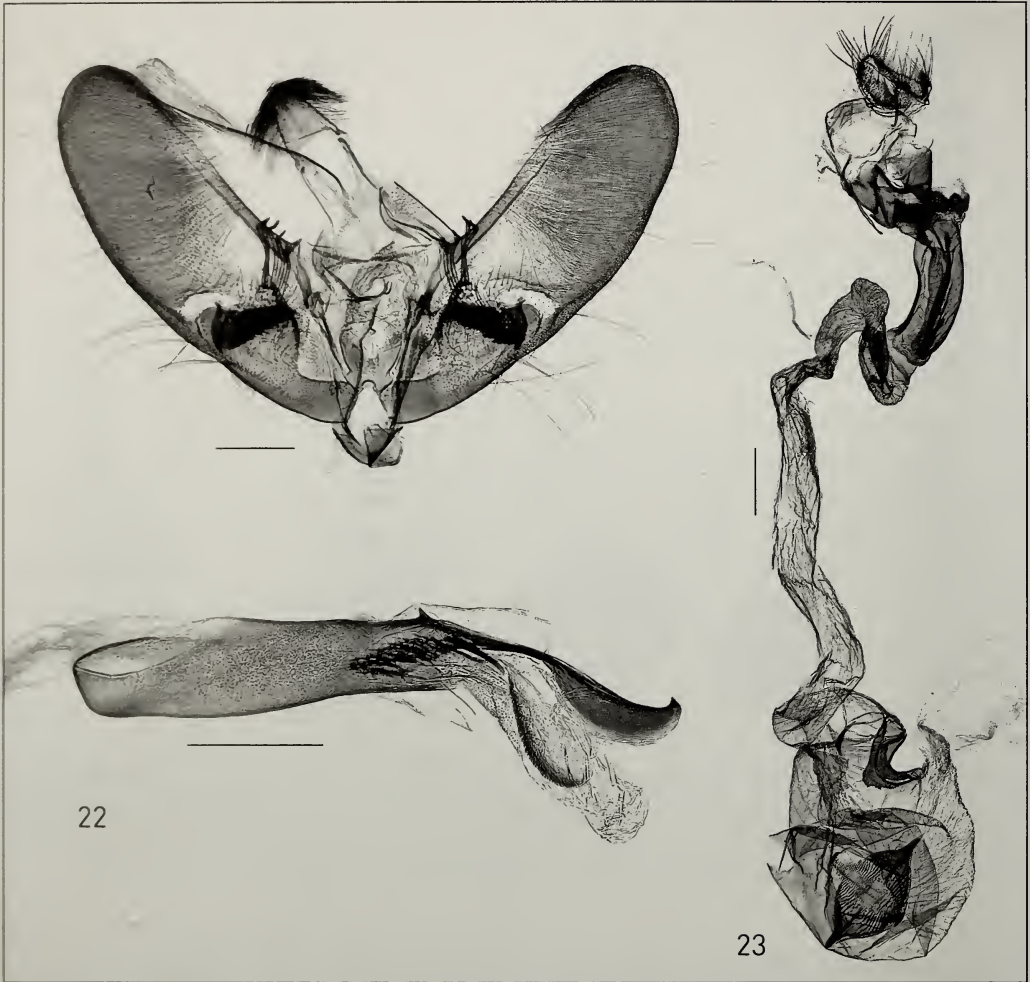
Figs 22–23. Copulatory organs of Crypsitya coclesalis (scale bars 500 \mu m). 22. \sigma Hainan province, Wanning, Jianfeng Ling, Beidazheng Primary school, 110 m, 28.vii.2008, Bingbing Hu & Li Zhang, leg., prep. gen. AT58 (NKUM). 23. \text{f} , China, Henan Province, Tongbai, Shuiliandong, 300 m, 26.vii.2000, Haili Yu leg., prep. gen. AT08011 (NKUM).

However, the dilated antennae are not synapomorphic for Ethiobotys because only E. ankolae shows this trait. The dilated mid tibia is not restricted to the afrotropical species placed in Ethiobotys as it is also present in males of the Chinese Pronomis (Munroe & Mutuura 1968). Thus, Ethiobotys clearly belongs to the ingroup of Anania .