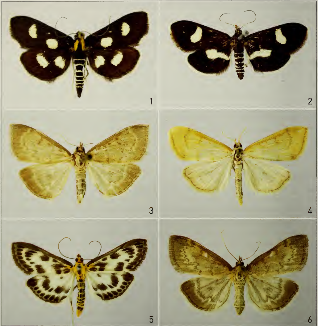
Figs 1–6. Adults of European Anania species. 1. A. funebris (= A. guttalis , A. octomaculata ) ♂, Germany, Chemnitz, 21.vii.1944, W. Heinitz leg. (MTD). 2. A. luctualis (formerly Algedonia ), ♀, Germany, Schleinbach (MTD). 3. A. terrealis (formerly Algedonia ), ♀, Germany, Sachsen, Moritzburg, 25.vii.1967, Bembenek & Krause leg. (MTD). 4. A. crocealis (formerly Ebulea ), ♂, Switzerland, St. Gallen, 1891, Wernicke coll. (MTD). 5. A. hortulata (formerly Eurrhypara ), ♂, Germany, Dresden-Wachwitz, 17.v.17, M. Koch leg. (MTD). 6. A. fuscalis (formerly Opsibotys ), ♀, Germany, Dresden, Dippelsdorf, 5.vii.1941 (MTD).