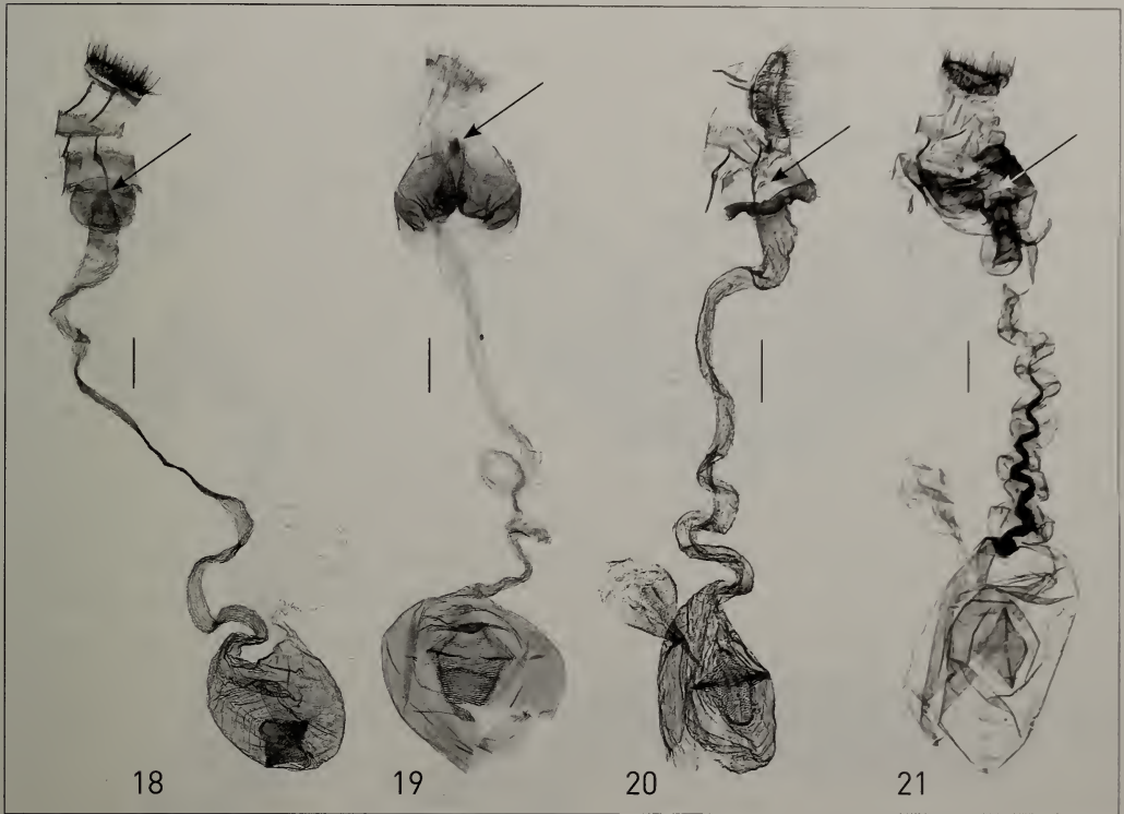
Figs 18–21. Female copulatory organs of Anania species; arrows pointing to digitiform structure (scale bars 500 \mu m). 18. A. funebris , Austria, Klausen, Tirol, 6.vi.1921, prep. gen. AT60 (MTD). 19. A. delicatalis , China, Moupin, viii.1890, prep. gen. 17373 (BMNH). 20. A. teneralis , China, Sichuan Province, Batang, Zhubalong, 2500 m, 10.vii.2001, Houhun Li & Xinpu Wang leg., prep. gen. AT08009 (NKUM). 21. A. vicinalis , Korea, Utikongo, Kongosan, 500 m, 25.vii.1940. H. Höne leg., prep. gen. AT63 (ZFMK).

of these genera with Anania , based on the common presence of the same characters mentioned by Maes.