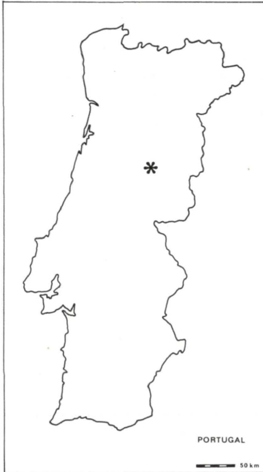
Fig. 1. Location (asterisk) of the study area (Serra da Estrela) in Portugal.

c. 70 km 2 and is delimited by the 1600 m s. m. contour line. It is situated in the southern part of the mountain range, mainly consisting of plateaus with some deep incisions (most of them glacial troughs), all built up by different types of granites mainly being muscovite and two-mica granites (see FERREIRA 1998).