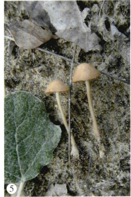
Fig. 3. Conocybe leporina . – Fig. 4. Conocybe papillata . – Fig. 5. Conocybe subxerophytica . – Phot. L. NAGY.