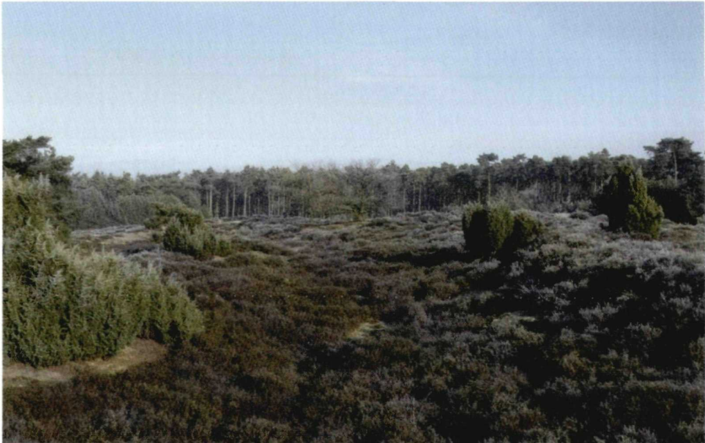
Fig. 5. View of Galberg, the heathland with Juniperus communis .