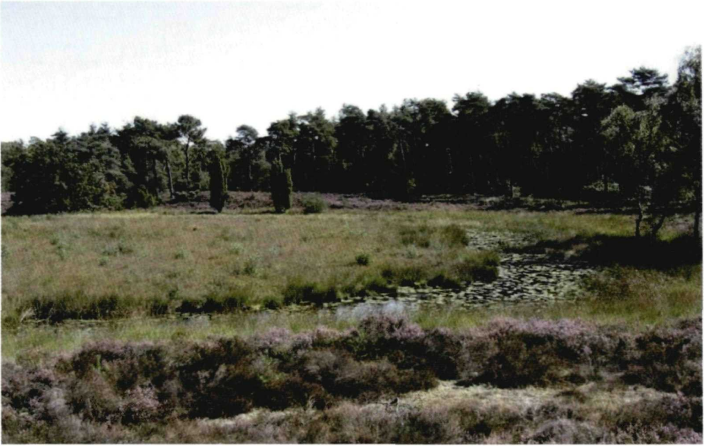
Fig. 4. View of the Pingo Klein Hasselsven, showing the eastern part of the circular fen.