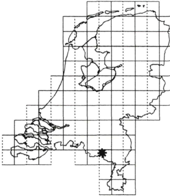
Fig. 1. Location of the study area in The Netherlands.