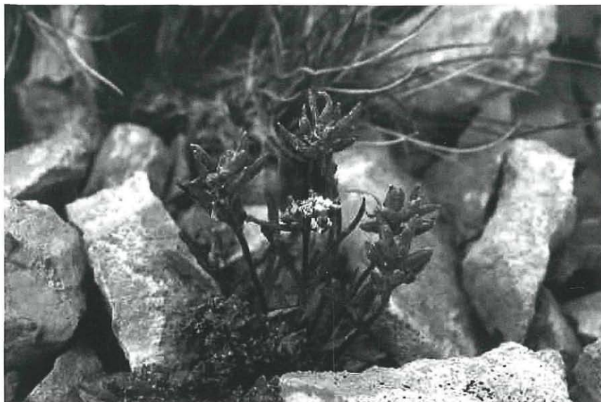
Fig. 2. A plant of B. alpina with flowers and unripe fruits at Mount Solstein WNW Innsbruck/N-Tyrol/Austria (August 2005).

mately 1 km to the West of the historic site in the Waideringer Nieder region of the Loferer Steinberge. Due to the limited number of plants, no voucher specimens were collected. More digital pictures of the North Tyrolean population in the Loferer Steinberge are available on request from the authors.