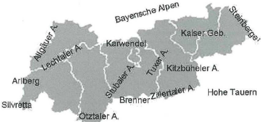
Fig. 4. Important mountain ranges in the North Tyrol and neighboring regions. The Steinberge (1) comprise the Loferer (Northern range) and the Leoganger Steinberge (Southern range).

In the context at hand it is of special interest to focus on the 94 taxa currently listed as regionally extinct (RE) in North Tyrol. At least seven of these taxa [ Alopecurus myosuroides HUDS., Bupleurum rotundifolium L., Galega officinalis L., Rosa majalis J. HERRM., Silene armeria L., Vicia casubica L., and Vulpia bromoides (L.) GRAY] have been reported only as rare casuals or garden escapes for North Tyrol and should therefore be completely removed from the Red List. From the remaining 87 taxa listed as extinct in the North Tyrol, 28 are belonging to the notoriously difficult (and therefore generally data deficient) apomictic genera Hieracium (20 taxa) and Rubus (8 Taxa), thus leaving 55 non-apomictic taxa currently listed as extinct for North Tyrol.