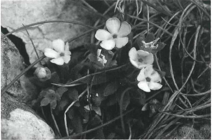
Fig. 1. Plant of A. hausmannii in the Loferer Steinberge/N-Tyrol/Austria (July 2006).

A. hausmannii was found in the Ulricher Nieder saddle between Mount Mitterhorn and Mount Großes Rothorn in July 2006 in an altitude of 2320 m above mean sea level (a.m.s.l.) [coordinates (WGS84): N 47°33'03", E 12°37'17"]. Fig. 1 shows one out of a total of three flowering plants of A. hausmannii found at that site. However, due to the in-