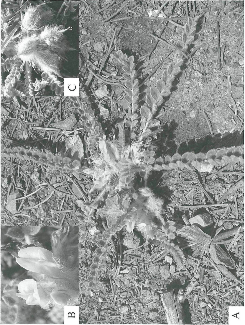
Fig. 1. Astragalus gigitensis : A habit, B flowers and C fruits.