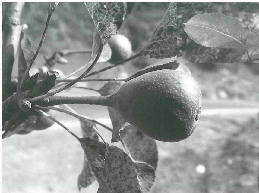
Fig. 4. Pyrus ghahremanii fruit. Insert: leaf.