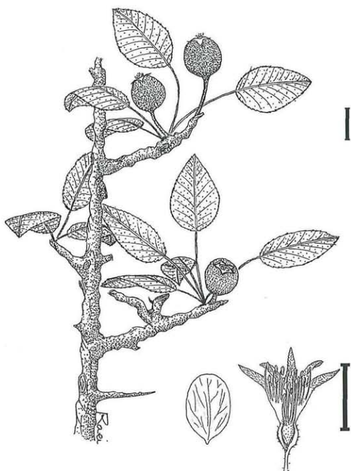
Fig. 6. Drawings of Pyrus giffanica , twig, petal and longitudinal section of a flower. — Scale bars: 2 cm (twig) and 1 cm (flower).

8 mm), tomentose at base; stigma clavate; stamens 20–25, filament with an obscure thickening at base, in two rings, outer ring longer (5 mm) than inner ring (4 mm). Pome globose, 2.5 \times 2.5 cm, green-yellowish, succulent, with numerous grit cells; sepals persistent, appressed to fruit; ovary 5-loculed, 2 ovules per locule; pedicels in fruit 2–2.5 cm, with a very obscure thickening just below fruit. (Fig. 6, 8)