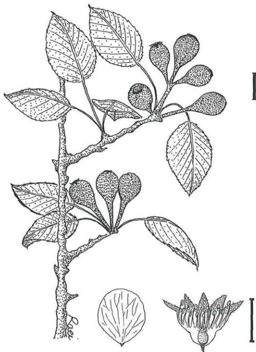
Fig. 2. Drawings of Pyrus ghahremanii , twig, petal and longitudinal section of a flower. – Scale bars: 2 cm (twig) and 1 cm (flower).