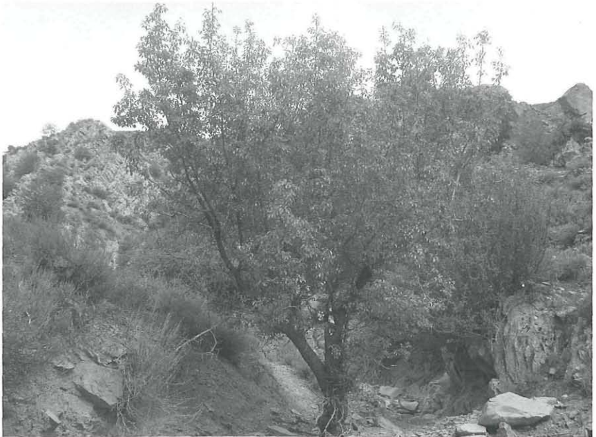
Fig. 9. Pyrus giffanica (in the foreground) and habitat at the type locality.