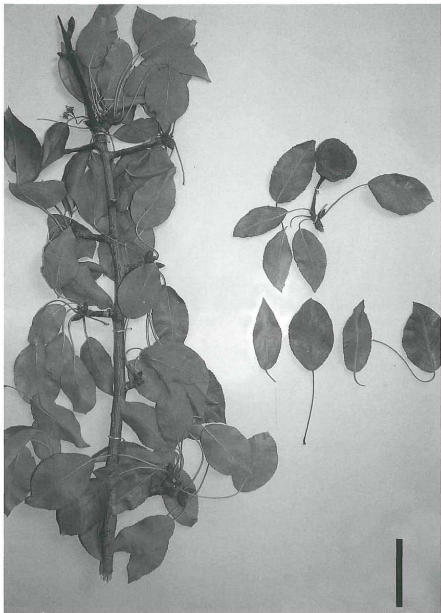
Fig. 7. Type specimen (holotype) of Pyrus giffanica in TUH. – Scale bar: 4 cm.