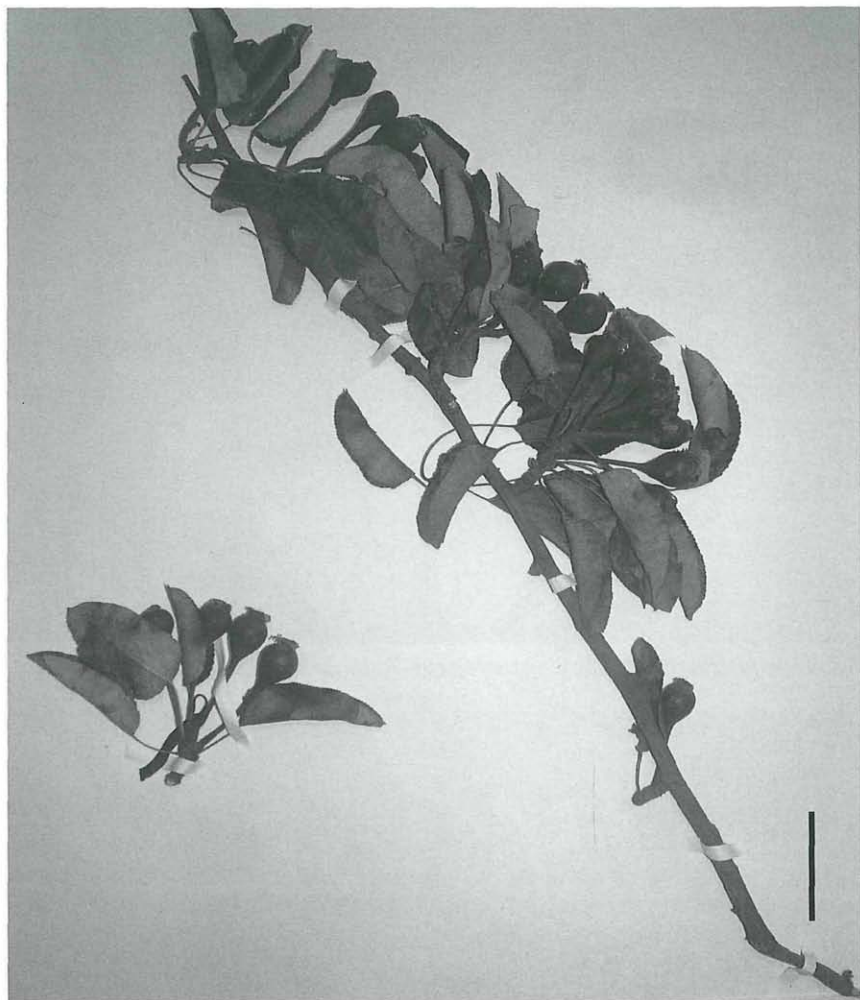
Fig. 3. Type specimen (holotype) of Pyrus ghahremanii in TUH. – Scale bar: 4 cm.