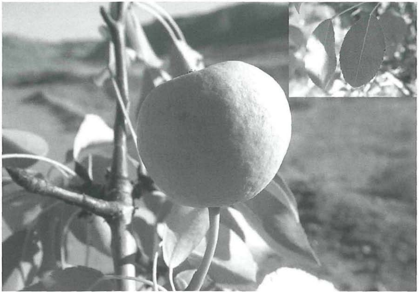
Fig. 8. Pyrus giffanica fruit. Insert: leaf.