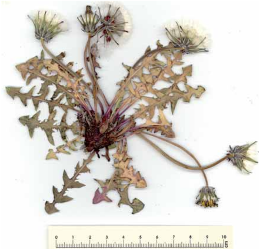
Fig. 1. Holotype of Taraxacum gratum . General habit.

periore fere purpuratae / purpureo-violascentes, parte obscura centrali subite in marginem album (0.2–) 0.3–0.5 (–0.6) mm latum transeunte, margine non raro dense ciliolato. Squamae interiores mutuo \pm aequilatae, laete prasiniae, subpruinosae, sub apice corniculo parvo praeditae. Ligulae marginales planae et breves, extus stria argute purpurate cinereo-nigra ornatae, denticulis apicalibus obscure cinereis, ligulae centrales ut videtur canaliculatae denticulis apicalibus purpurascentibus, dilute cinereis vel luteis. Antherae polline carentes. Stigmata clare lutea usque subviride lutea. Achenia (Fig. 2) longa et angusta, anguste fusiformia, pyr. incl. (3.5–) 4.1–5.1 mm longa, 0.8–1.0 (–1.1) mm lata, obscure badio-rubra usque cinnamea vel badia, corpore in quinta parte superiore spinuloso spinulis directisve acutissimis, infra verrucoso, tuberculato usque glabro (latus exterior acheniorum marginalium aliquando per toto spinulosum), supra in pyramiden cylindricam, angustam, (0.9–) 1.2–1.5 mm longam, crebrius minimum uno spinulo instructam subite abeunte. Rostrum (6–) 8–