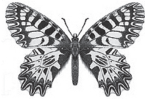
SOCIETAS EUROPAEA LEPIDOPTEROLOGICA