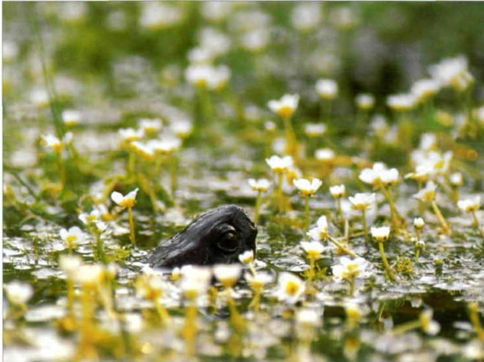
Fig. 6: Adult males usually have reddish iris. Although this feature alone cannot be used for sex identification, it may be useful for nature observations when only the turtles' heads reach above the water surface.

JABLONSKI (1998) and JABLONSKI & JABLONSKA (1998) report on 120 years old individuals, but their data is highly anecdotal. It is obvious that the European pond turtle is a long lived animal, but more information is needed on the subject.