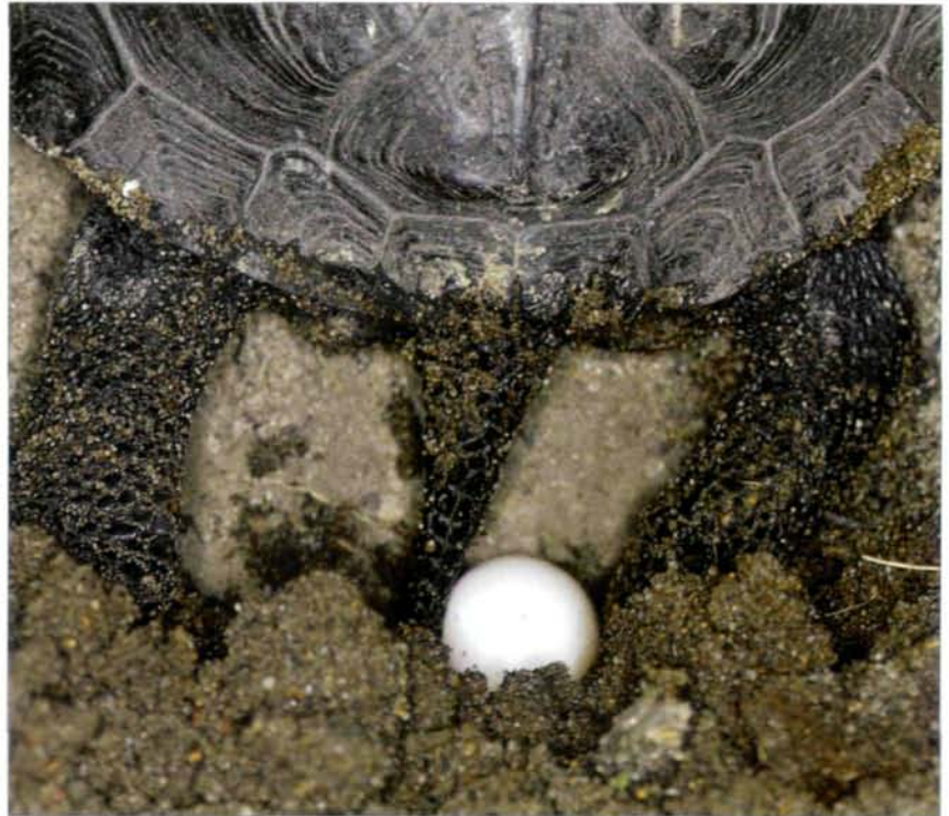
Fig. 10-11: Oviposition. In Poland the oviposition period lasts from the third decade of May to middle of June. In Poland European pond turtles lay 14-15 eggs during the evening or night once a year.

during the first few days after laying and during hatching or emergence of the neonates to the surface. In eastern Poland 70-80% of the nests are destroyed within a few days after laying (JABLONSKI & JABLONSKA 1998). The same situation has been observed in other areas (LUKINA 1971, SERVAN 1988, KOTENKO 1999). In central Poland, however, we have not observed any destruction of clutches immediately after oviposition. Some nests in central Poland may be destroyed during the hatching period (ZEMANEK 1992), in the second half of August or in September. In 1995, 6 out of 14 known clutches had been destroyed during the hatching period by predators, an additional one was accidentally smashed by a vehicle.