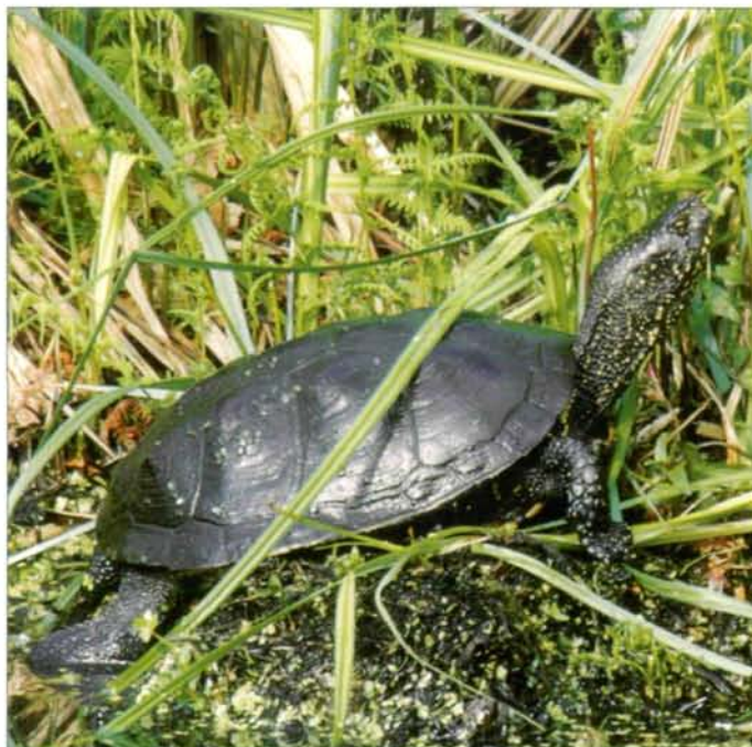
Fig. 7: A basking European pond turtle. The easiest way for observation is to watch them basking on banks. In spring, when the water is cold, they spend a lot of time basking.

ZEMANEK & MITRUS 1997) (Fig. 7). Very small individuals were noted basking on leaves of water plants as well. Places used for basking are often easily identified by trampled plants and soil. As water and air temperature is lower during earlier parts of the year, individuals spend more time on basking in spring than in summer. Spring is the best time for observation as the animals are generally less alert during this period.