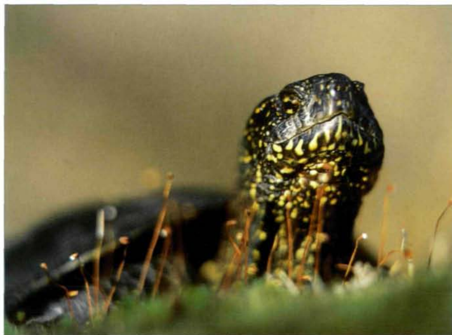
Fig. 5: Portrait of female E. orbicularis . In Poland female E. orbicularis typically have yellow iris. They are larger than males and reach a carapace length of about 20 cm.

ching sexual maturity by the female, but more information on the subject is needed. Sometimes scutes are completely smooth with no visible annuli rings at all. The rings are better visible on plastron scutes than on those of the carapace (MITRUS & ZEMANEK unpubl. data).