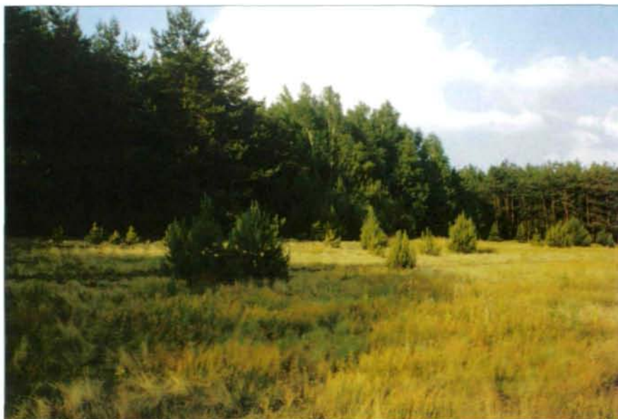
Fig. 9: Typical nesting place of the European pond turtle in Poland. Emys orbicularis lays eggs at sunny sites, usually covered with xerothermic vegetation. The surface of the soil at such sites must be hard to prevent the breeding chamber from collapsing during digging.

tes (grasshoppers) which had fallen into water. Turtles living in marshy areas mostly feed on aquatic invertebrates (BANNIKOV 1951), characterising E. orbicularis as non-specialised predator. LUKINA (1976) and KOTENKO (1999) describe the occurrence of mostly invertebrates in their diet as well. Plants play a large part of the adult diet as well (BANNIKOV 1951, LABBORONI & CHELAZZI 1991). In captivity, neonates fed on life invertebrates, sporadically take up water plants (MITRUS & ZEMANEK unpubl. data). Emys orbicularis eats invertebra-