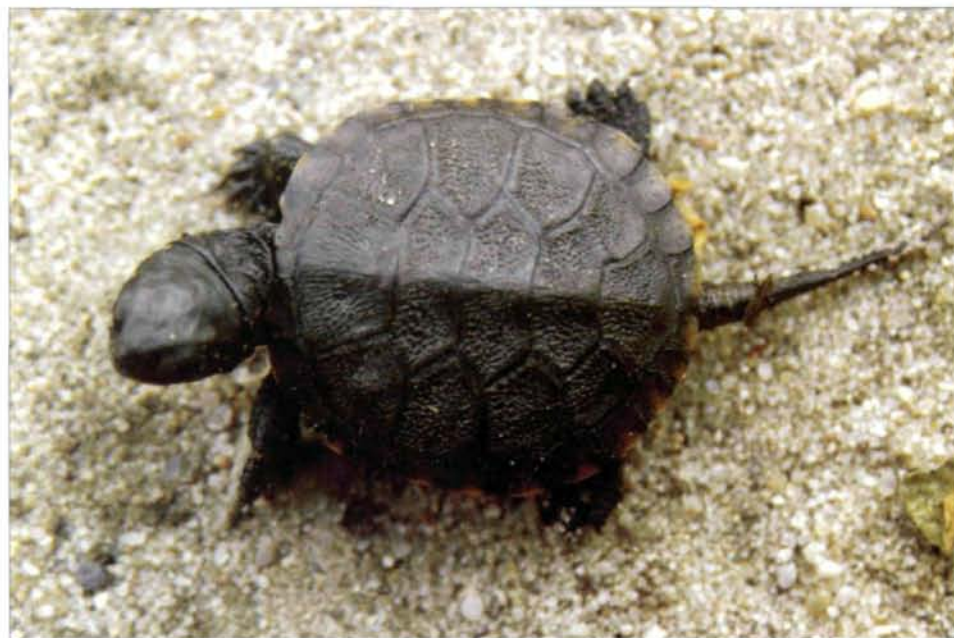
Fig. 12: Hatchling of the European pond turtle. If summers are warm enough individuals are able to hatch in the second half of August or in September. They migrate to water reservoirs at the end of summer or they hibernate on land and migrate to aquatic habitats during the following spring.

breeding chamber. All hatchlings found inside the chamber - four alive and eight dead - were in an upright position. The upright position of neonates in breeding chambers in spring was described by ANDREAS & PAUL (1998). We also observed opened nests on 3 rd and 5 th April 1999 and found wandering neonates on 3 rd June 1992, 23 rd April 1995 and 16 th April 1999. Dead ones (killed by cars) were