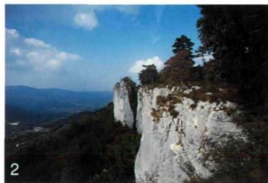
Figs 1-2: 1 – the village Črni Kal with the investigated cliffs from the Rižana valley; 2 – vertical cliffs above Črni Kal.