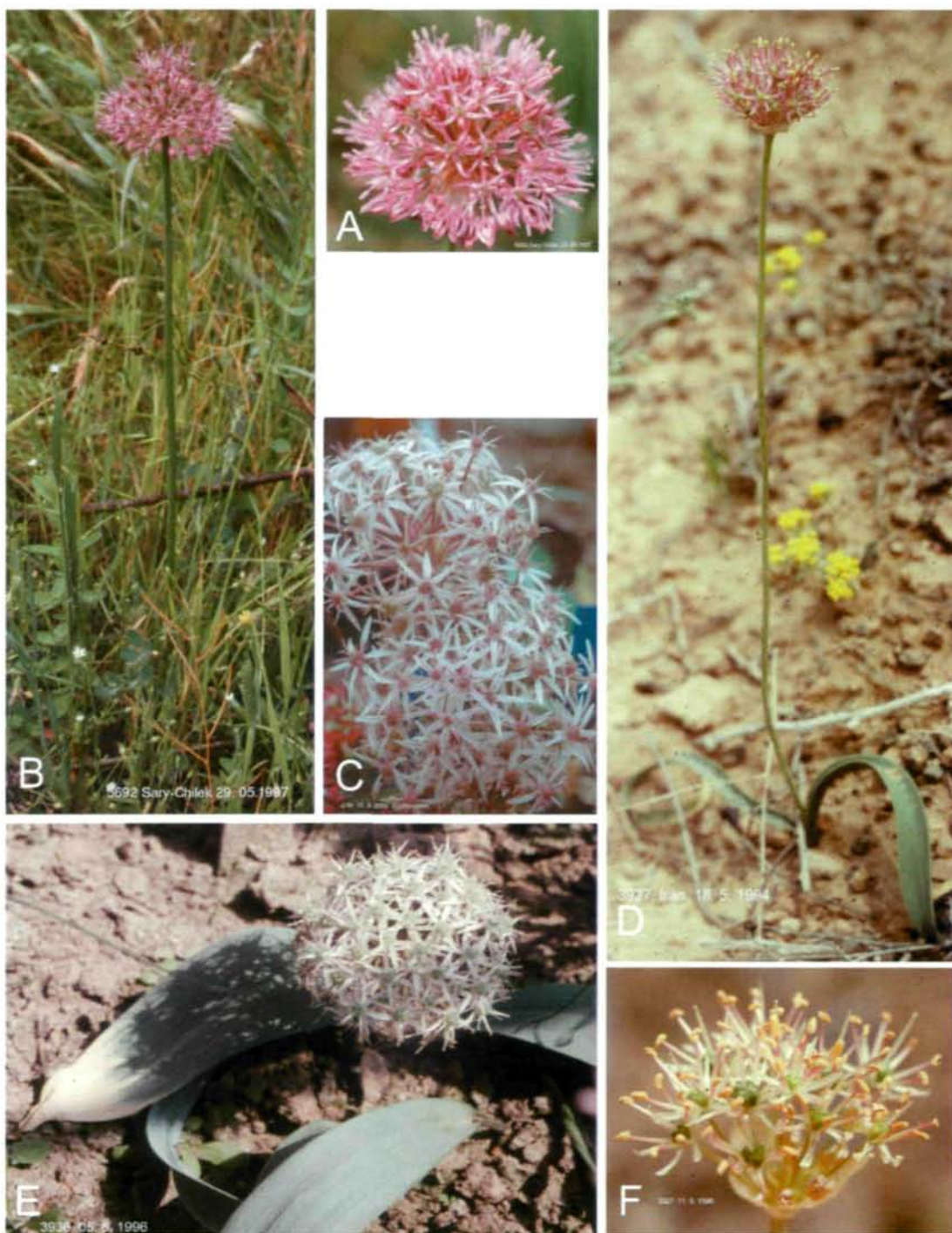
Plate 2. A: Inflorescence, and B: Flowering plant of Allium arkitense at type location; C: Inflorescences, and E: Flowering plants of Allium pseudobodeanum under cultivation; D: Flowering plant of Allium assadii c. 60 km S Delijan, and F: Inflorescence of this plant under cultivation.