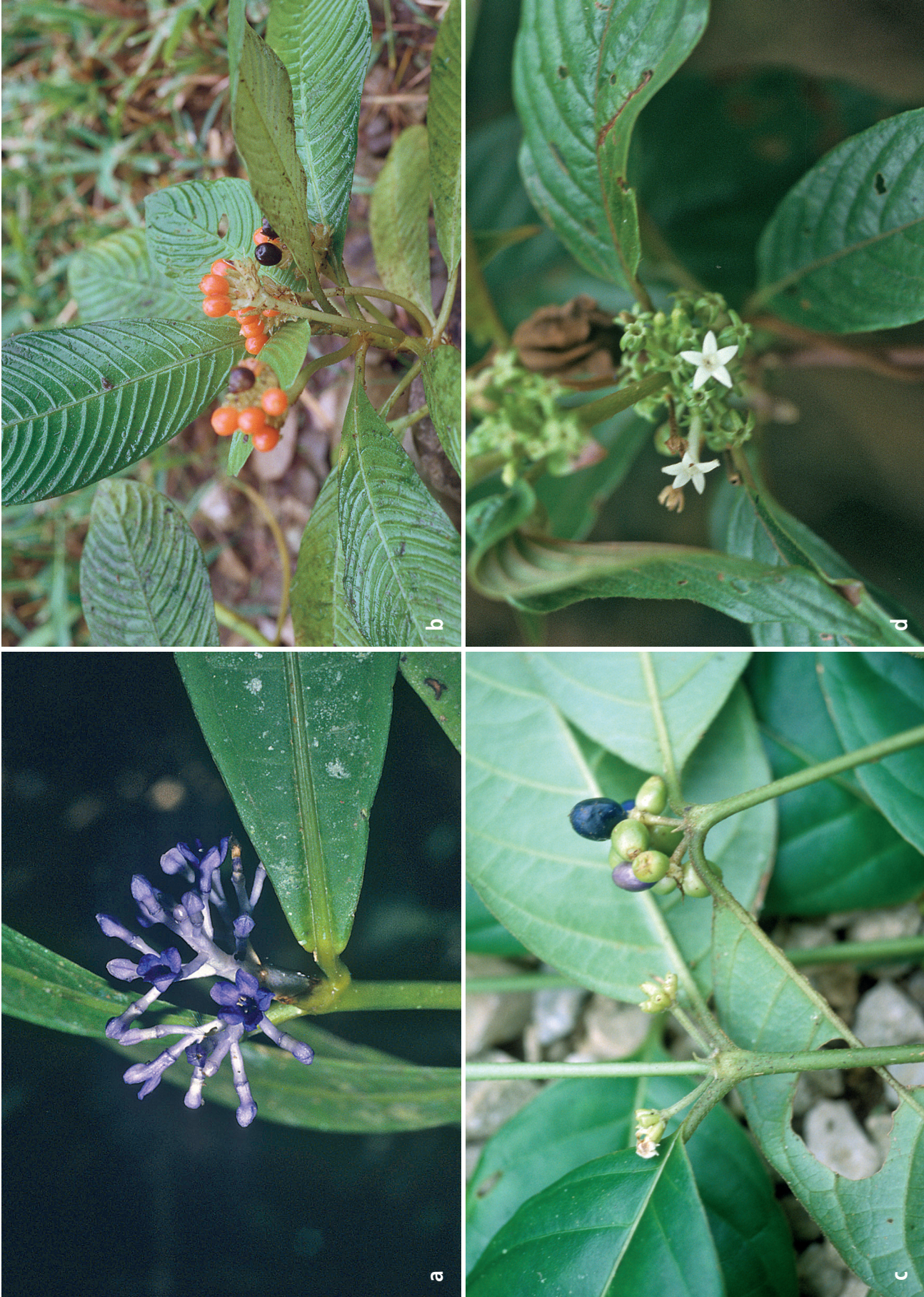
Plate 2: (a) Faramea suerrensis , (b) Notopleura polyphlebia (syn. Psychotria polyphlebia ), (c) Ronabea latifolia (syn. Psychotria erecta ), (d) Sabicea panamensis