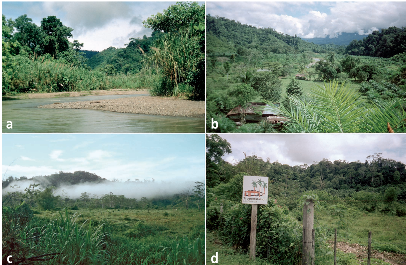
Plate 2: Lichen habitats, (a) valley of Río Bonito, river banks and gallery woodland, (b) cultivated land and secondary forest near Río Bonito, (c) pasture and hillside forest near La Gamba, (d) roadside vegetation at field station "Tropenstation La Gamba". Photos: O. Breuss.

on a vertical road cutting at Fila Gamba. A small growth of Cladonia subradiata was found in the garden of the Esquinas Rainforest Lodge.