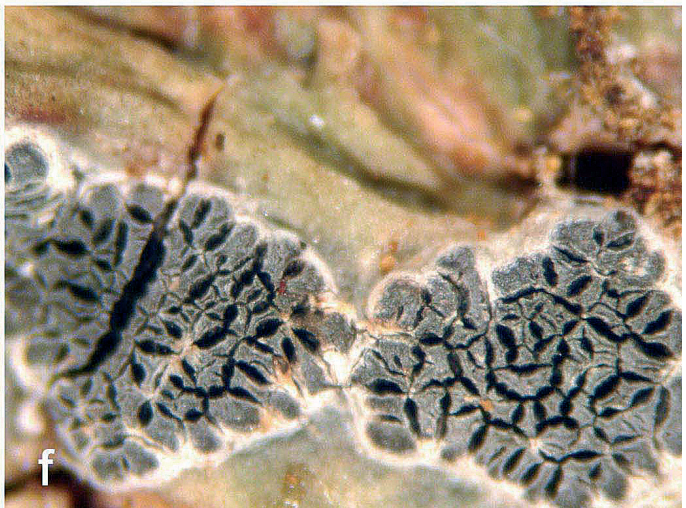
Plate 4: Corticolous lichens, (a) Coccocarpia filiformis , (b) Sarcographa ramificans , (c) Graphis chrysocarpa , (d) Graphis vestitoides , (e) Platythecium allosporellum , (f) Sarcographa labyrinthica .