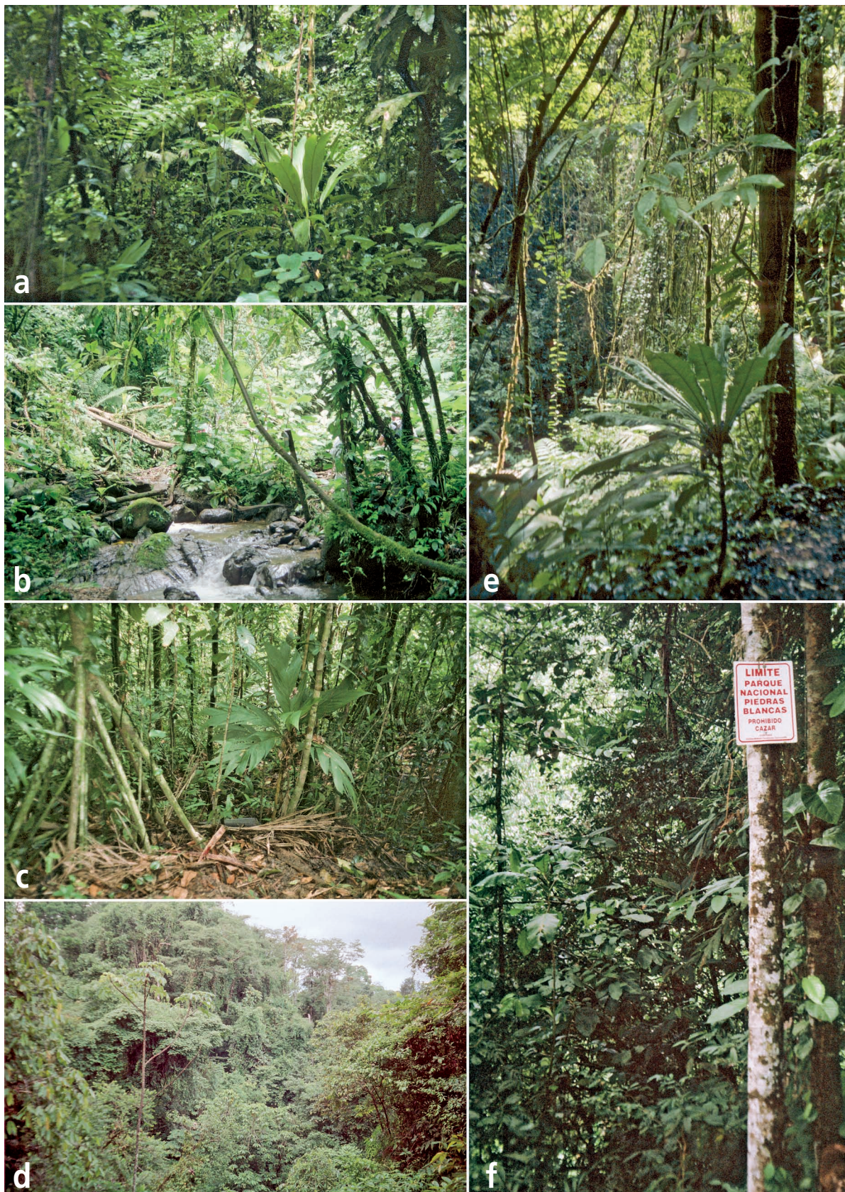
Plate 1: Lichen habitats: tropical rainforest (Esquinas forest), (a) interior of primary rainforest, (b) understory along a creek near Esquinas Rainforest Lodge, (c) interior of rainforest on ridge top, (d) canopy layer of rainforest, (e) interior of primary rainforest in a ravine, (f) margin of primary forest near field station "Tropenstation La Gamba".