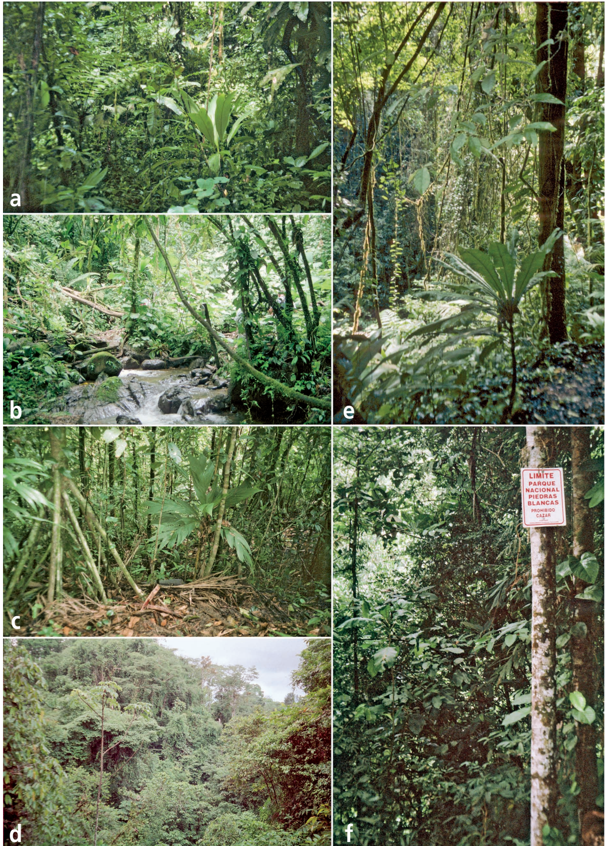
Plate 1: Lichen habitats: tropical rainforest (Esquinas forest), (a) interior of primary rainforest, (b) understory along a creek near Esquinas Rainforest Lodge, (c) interior of rainforest on ridge top, (d) canopy layer of rainforest, (e) interior of primary rainforest in a ravine, (f) margin of primary forest near field station "Tropenstation La Gamba".