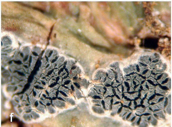
Plate 4: Corticolous lichens, (a) Coccocarpia filiformis , (b) Sarcographa ramificans , (c) Graphis chrysocarpa , (d) Graphis vestitoides , (e) Platythecium allosporellum , (f) Sarcographa labyrinthica .