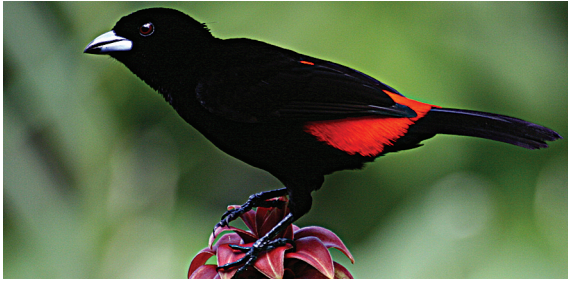
Fig. 21: Ramphocelus costaricensis (Cherrie's Tanager).