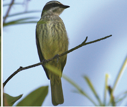
Fig. 17: Legatus leucophaeus (Piratic Flycatcher).