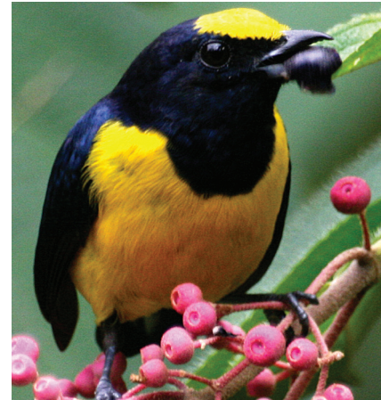
Fig. 24: Euphonia imitans (Spot-crowned Euphonia).