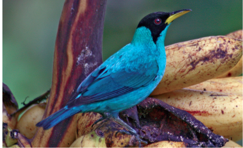
Fig. 22: Chlorophanes spiza (Green Honeycreeper).