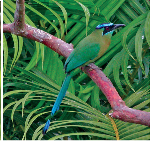
Fig. 11: Momotus momota (Blue-crowned Motmot).