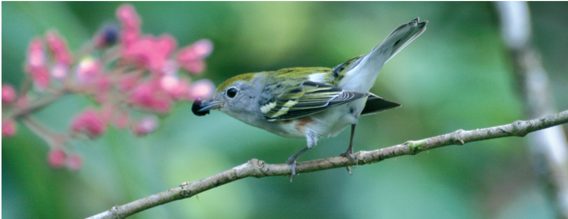
Fig. 20: Dendroica pensylvanica (Chestnut-sided Warbler).