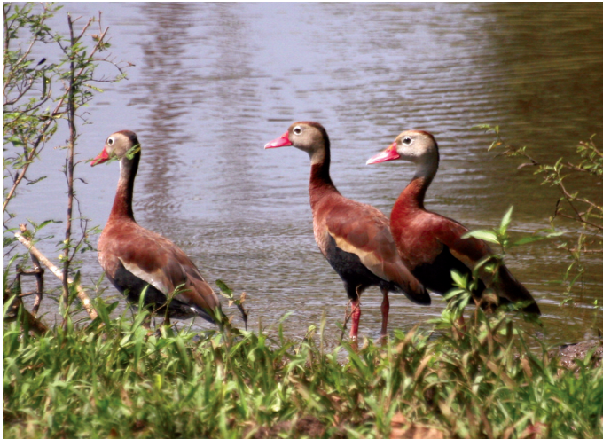
Fig. 2: Dendrocygna autumnalis (Black-bellied Whistling-Duck)