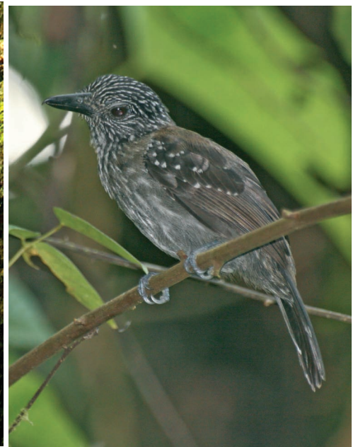
Fig. 15: Thamnophilus bridgesi (Black-Hooded Antshrike).