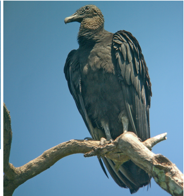
Fig. 5: Sarcoramphus papa (King Vulture).