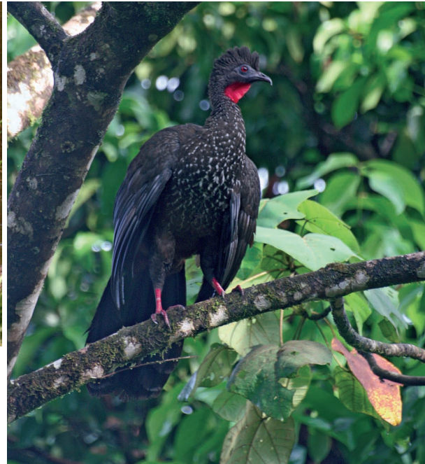
Fig. 3: Penelope purpurascens (Crested Guan).