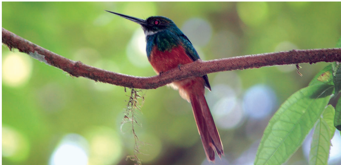
Fig. 12: Galbula ruficauda (Rufous-tailed Jacamar).