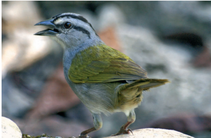
Fig. 23: Arremonops conirostris (Black-striped Sparrow).