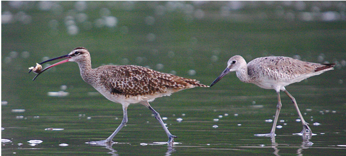
Fig. 6: Numenius phaeopus (Whimbrel) and Tringa semipalmata (Willet).