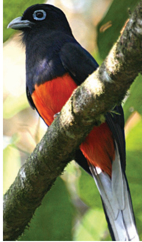
Fig. 10: Trogon bairdii (Baird's Trogon).