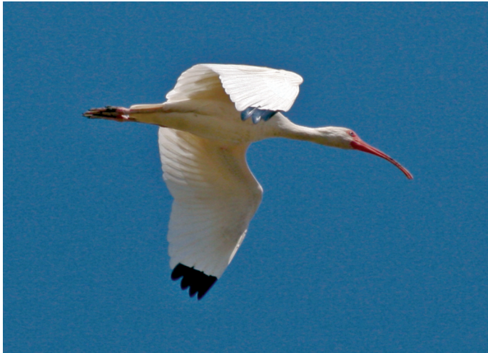
Fig. 4: Eudocimus albus (White Ibis).