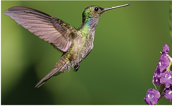
Fig. 9: Amazilia decora (Charming Hummingbird).