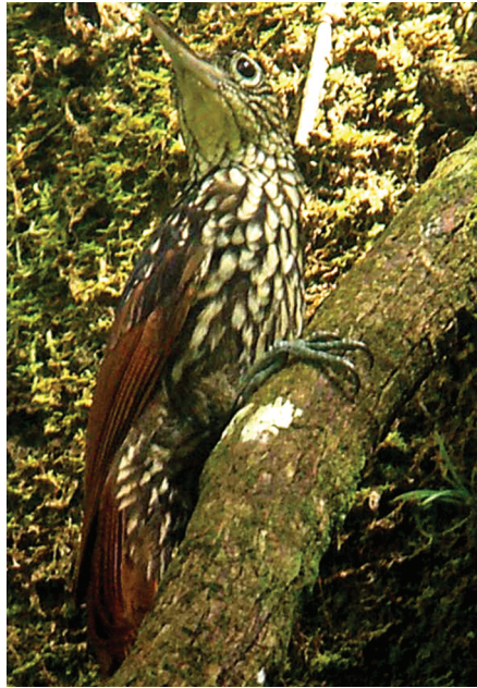
Fig. 14: Xiphorhynchus lachrymosus (Black-striped Woodcreeper).