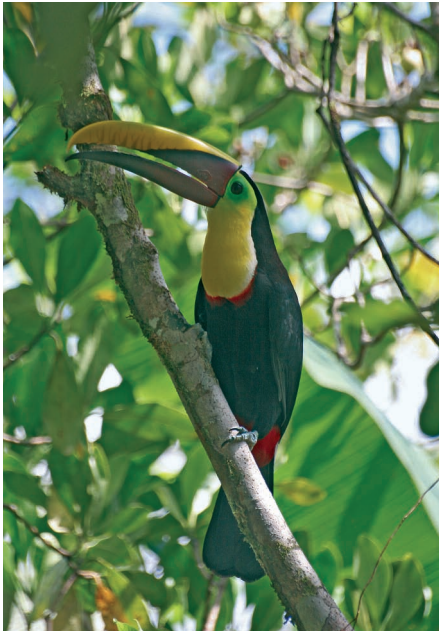
Fig. 13: Ramphastos swainsonii (Chestnut-mandibled Toucan).