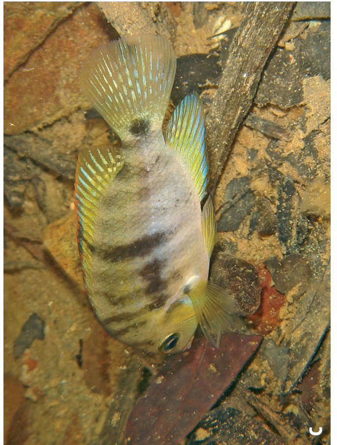
Plate 3: (a) Sicydium salvini , (b) Awaous transandeanus , (c) Archocentrus sajica , (d) Tomocichla sieboldii