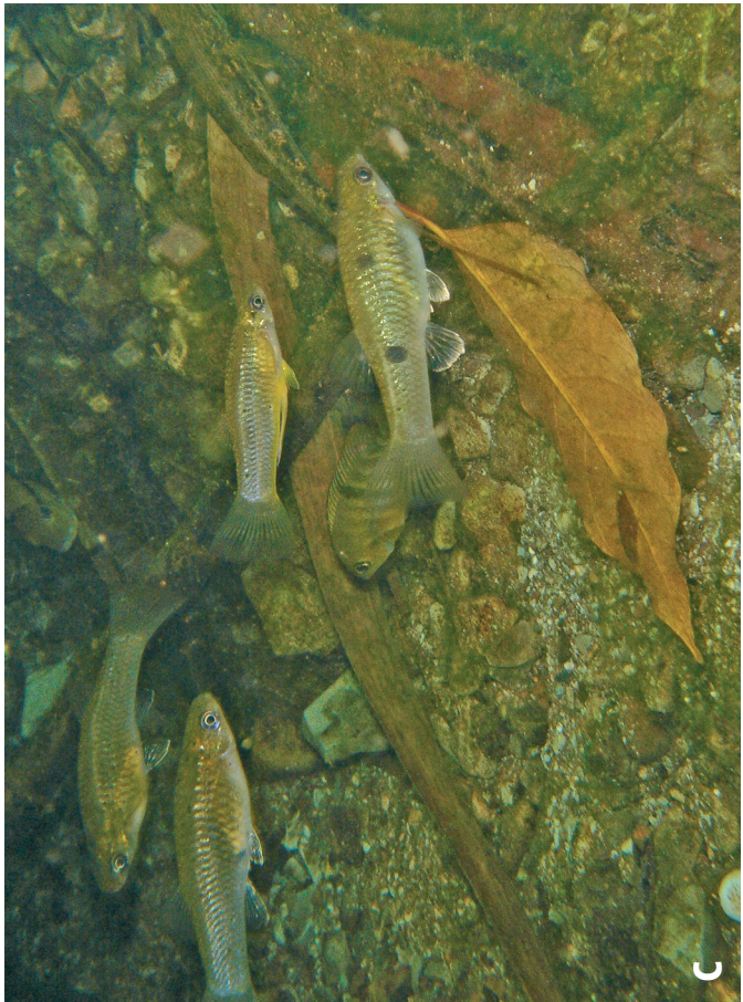
Plate 2: (a) Brachyrhaphis rhabdophora , (b) Astyanax aeneus , (c) Poeciliopsis paucimaculata (d) Poeciliopsis retropinna