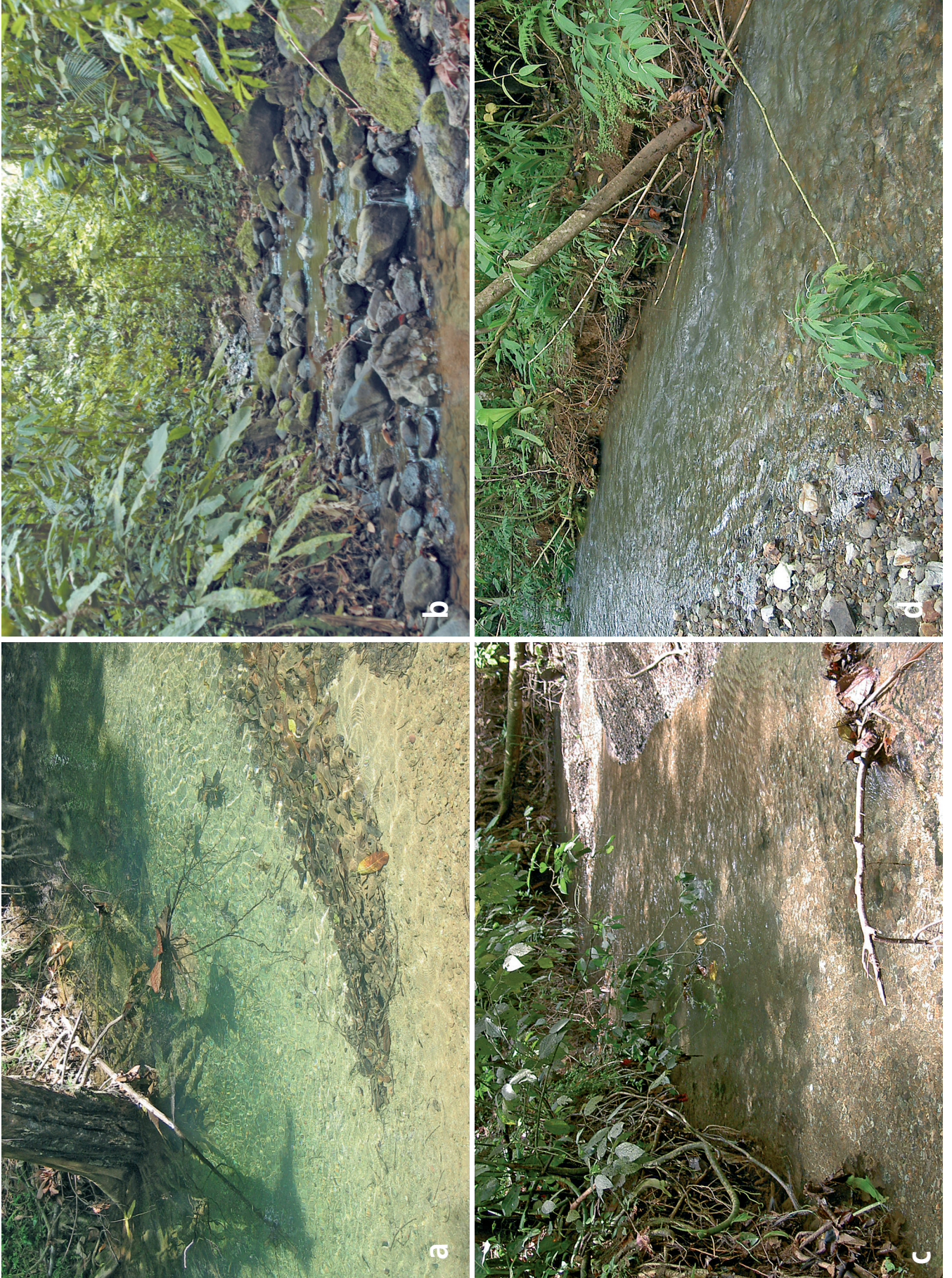
Plate 1: Four distinguished choriotope types. (a) pool, (b) cascade, (c) site with moderate velocity, (d) riffle