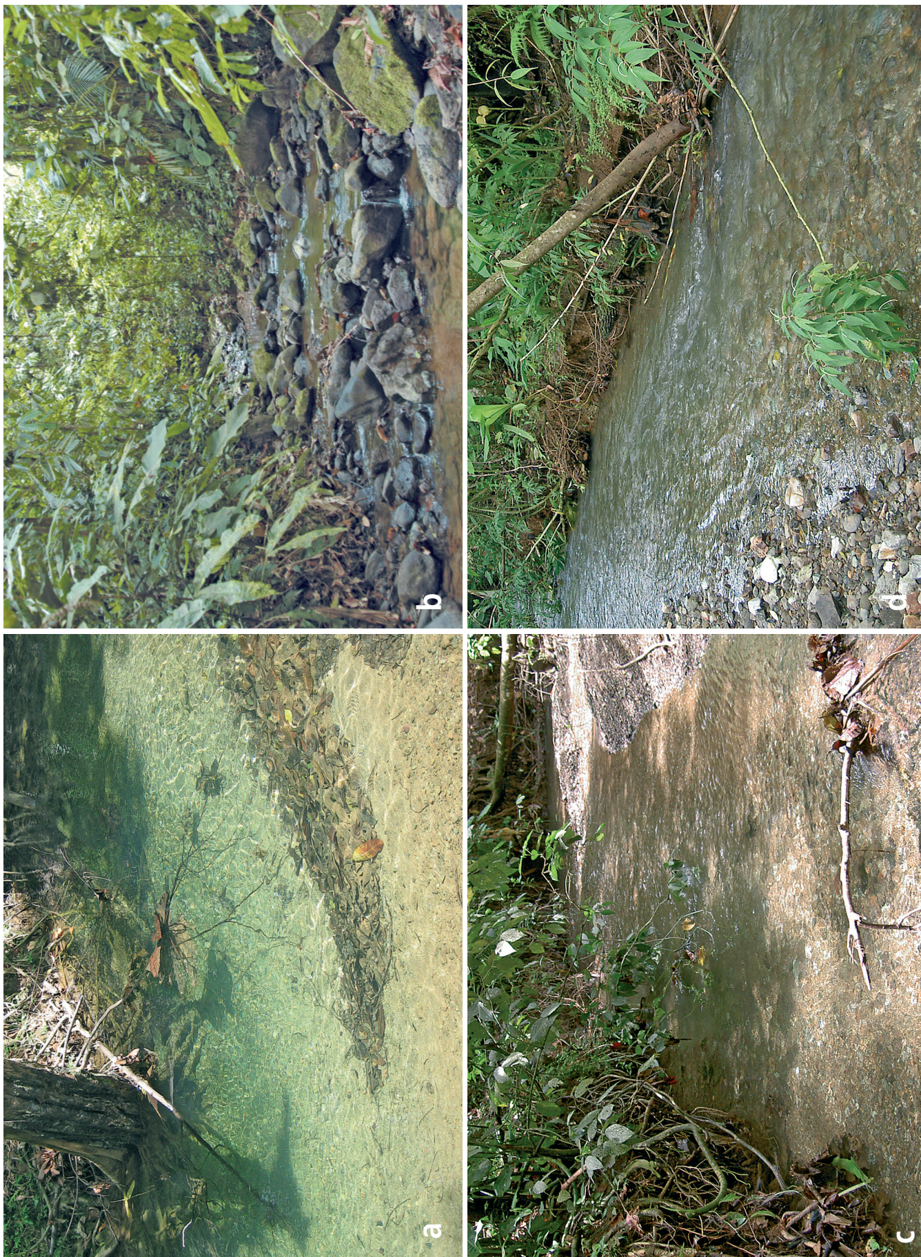
Plate 1: Four distinguished choriotope types. (a) pool, (b) cascade, (c) site with moderate velocity, (d) riffle