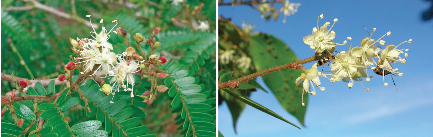
Fig. 3: Flowers of Peltogyne purpurea (left) and Copaifera camibar (right) (Caesalpiniaceae, Fabaceae), an example of the group of species that produce flowers during the middle of the rainy season and set fruits during the dry season.

serve any species which require more than a year for fruit maturation, which is commonplace in tropical dry forest tree species (FRANKIE et al. 1974).