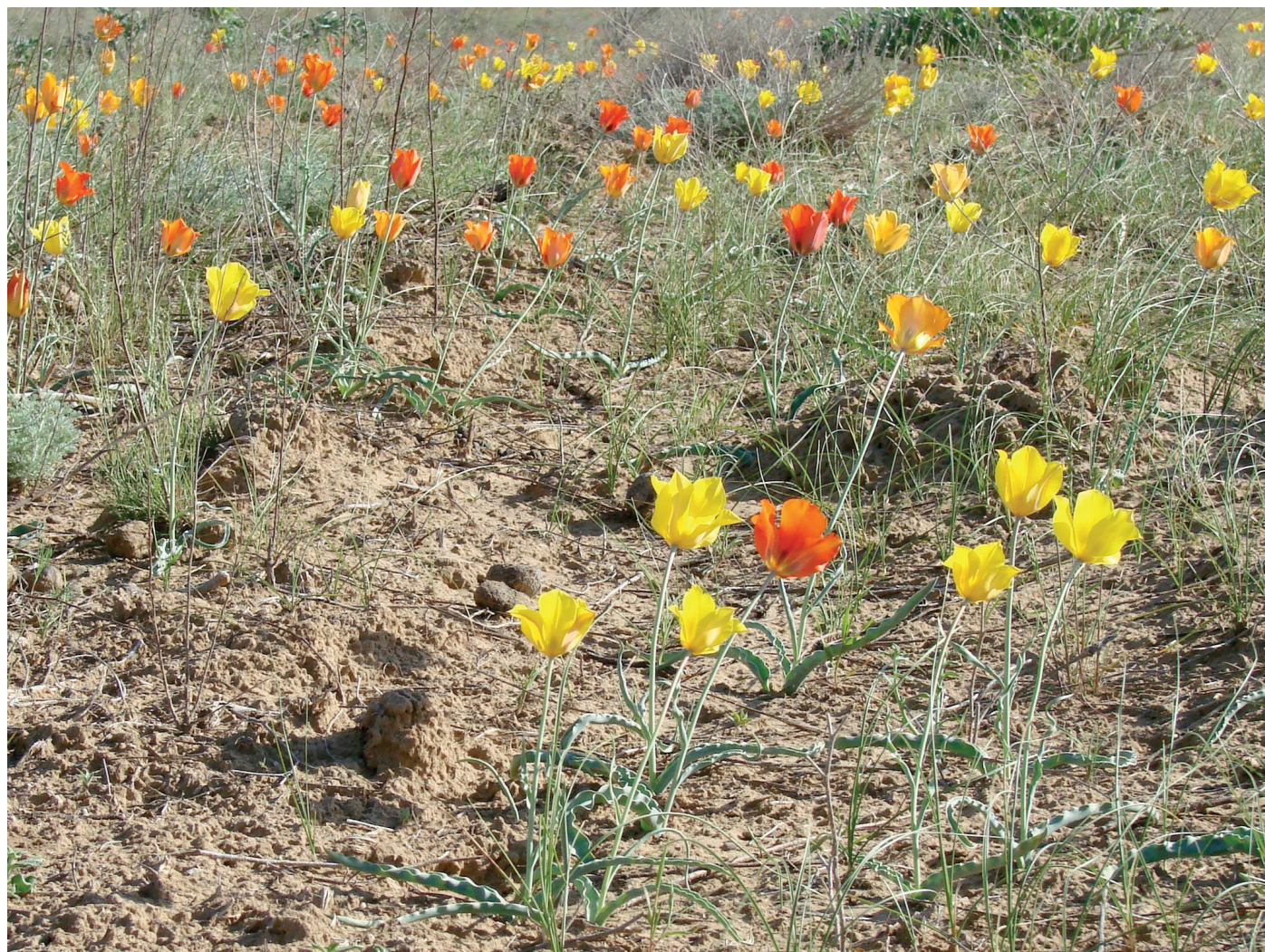
Fig. 1: Large population of Tulipa lehmanniana in South-Eastern Kyzylkum.

This species is widespread on all ridges of the Nuratau mountains, from eastern to western extreme end. It grows as solitary specimens, small groups or large populations (up to several hundred plants), at 800-900 m a.s.l. to 1800-2000 m a.s.l., among forb-tall grass, sagebrush-herbaceous communities, semishrubs and shrubs, particularly on relatively humid northern and western slopes. The largest populations registered on the Nuratau ridge, where Tulipa affinis occurs quite often (Fig. 4). The number of generative specimens in local populations vary from 4-5 to 70-80, 100 or more per 100 m 2 . In some areas on the watershed of Nuratau, blooming tulips makes the landscape bright red, there are up to 4-5 generative specimens per 1 m 2 .