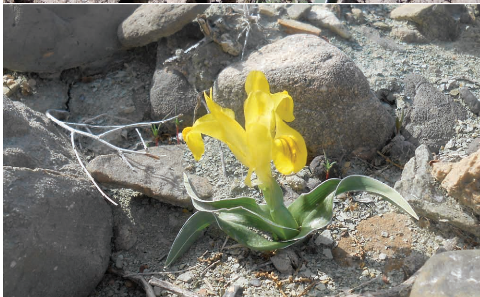
Fig. 2: Iris victoris F. O. KHASS., U. KHUZH. & N. RAKHIMOVA