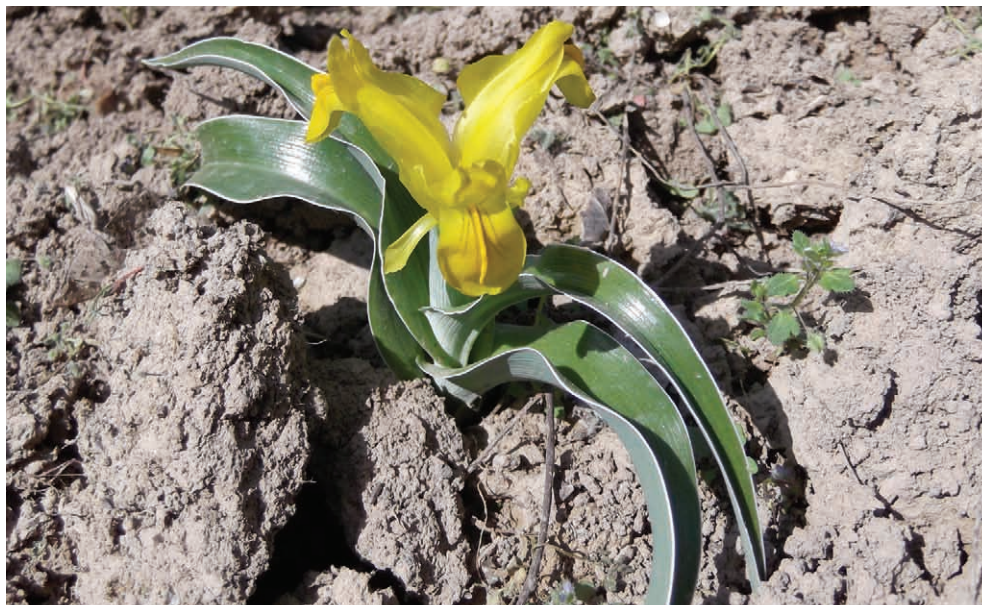
Fig. 1: Iris svetlanae (VED.) F. O. KHASS.