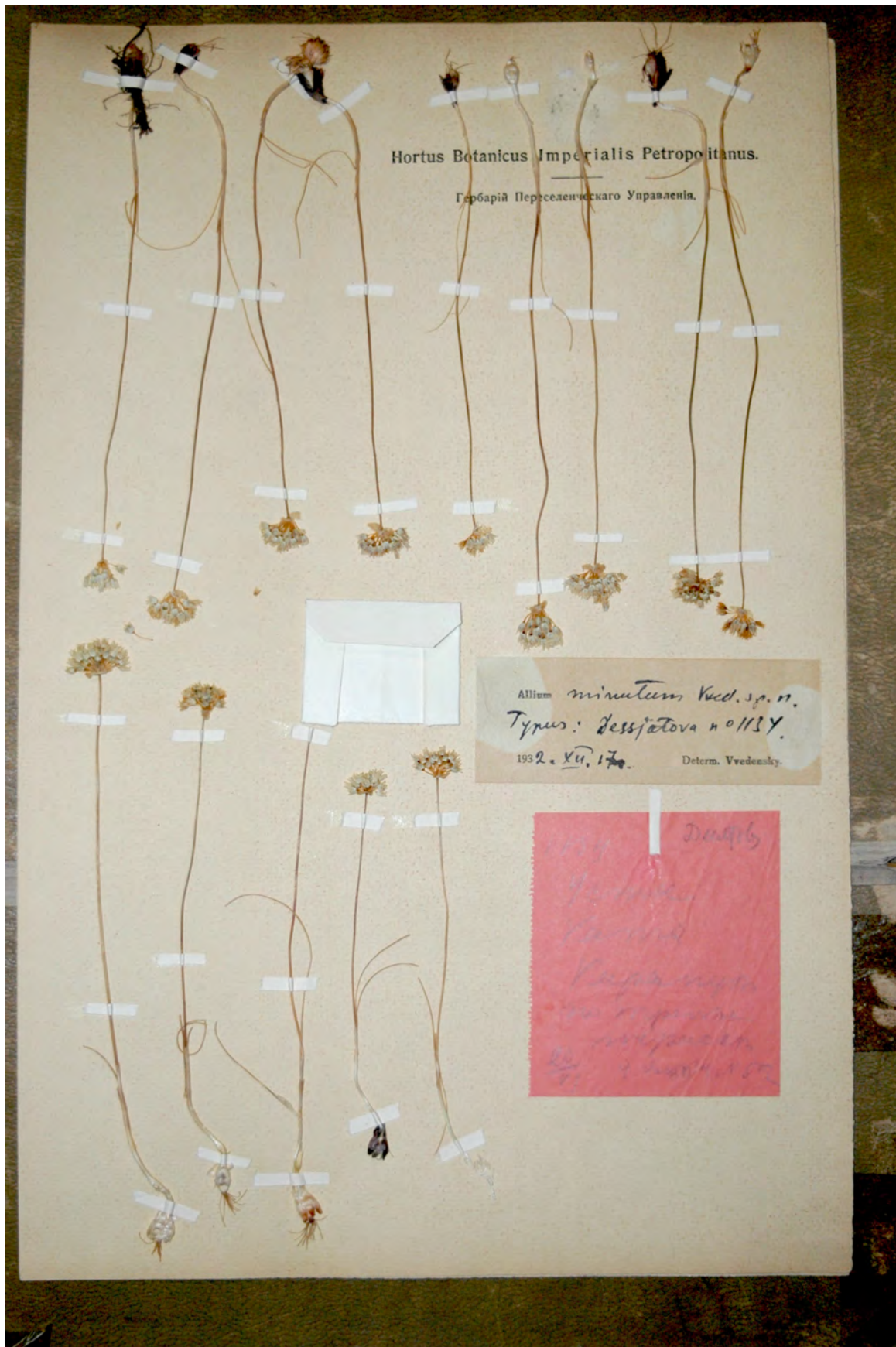
Fig. 4: Isotype of A. minutum Vved.