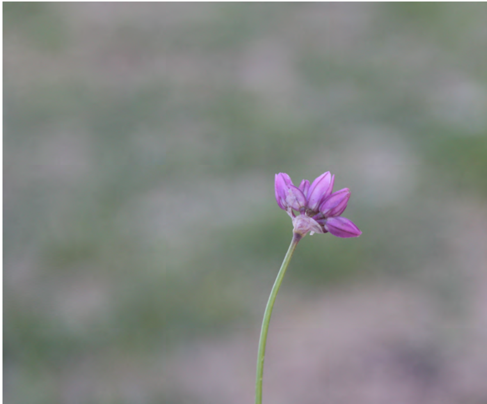
Fig. 2: Flowering A. aktauense sp. nov.