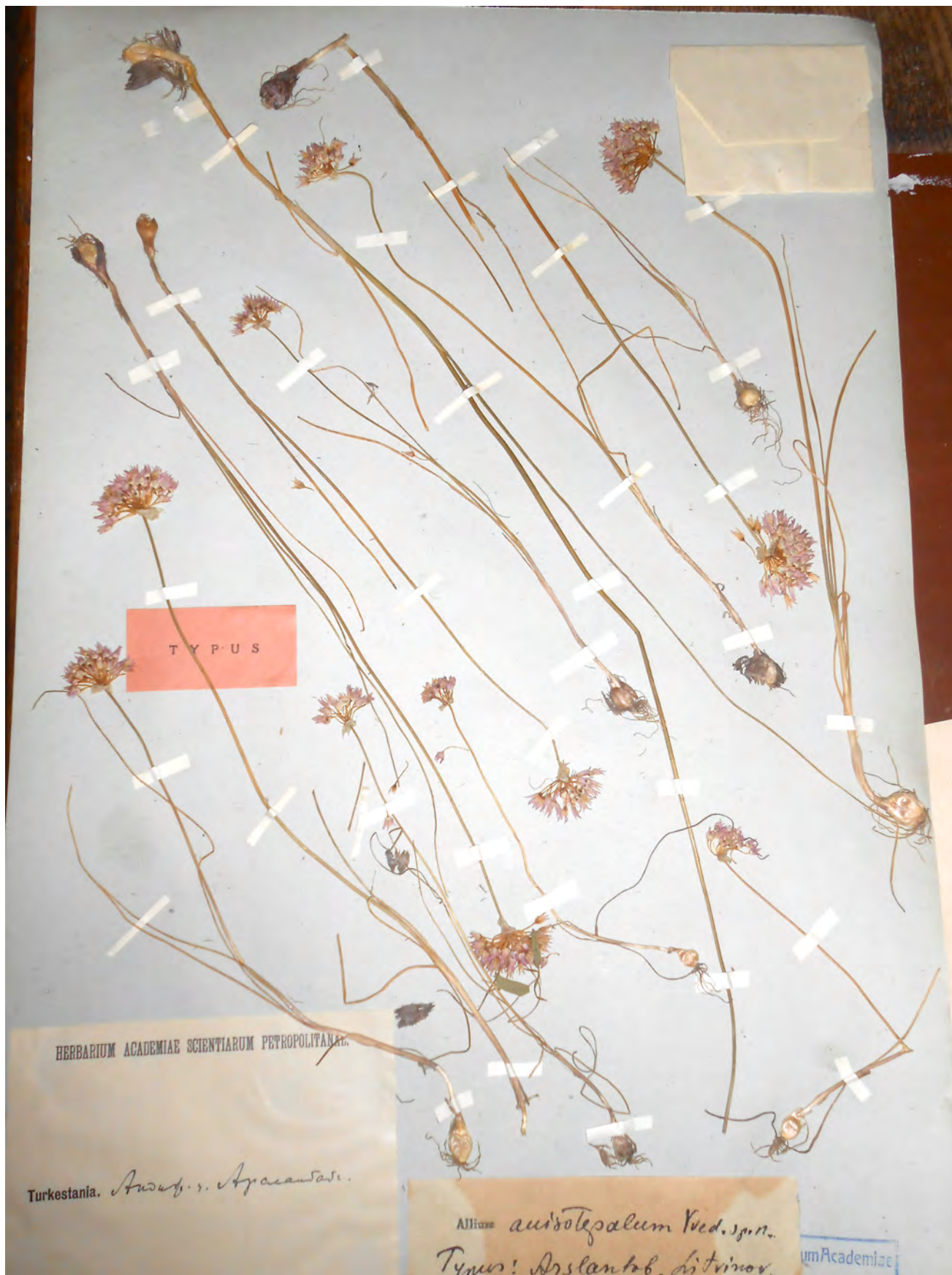
Fig. 6: Type of A. anisotepalum VVED.