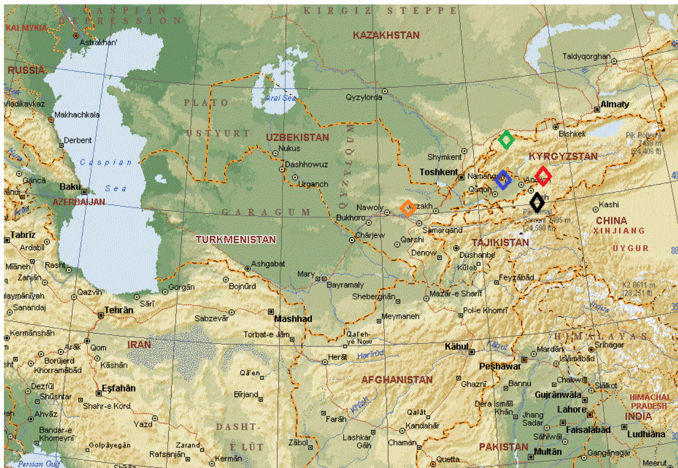
Fig. 1: Distribution of species from sect. Minuta (orange - Allium aktauense , blue - A. orunbai , green - A. parvulum , red - A. minutum , black - A. anisotepalum ).