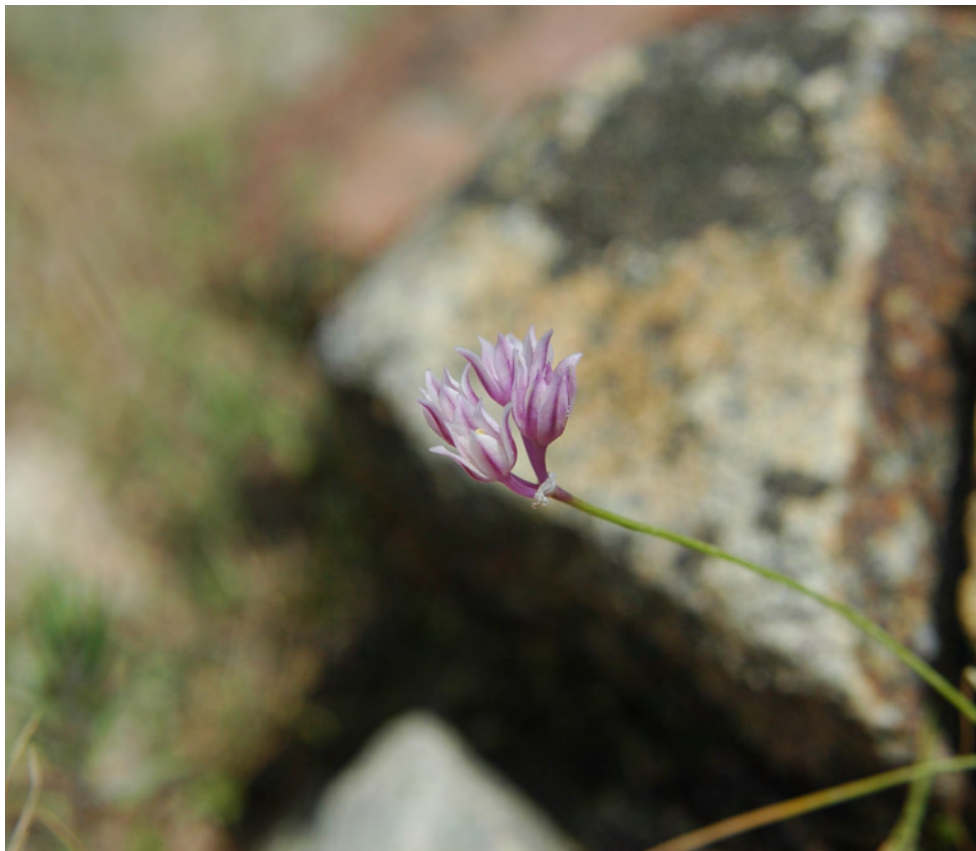
Fig. 3: Flowering A. orunbai F.O. KHASS. & R.M. FTITSCH