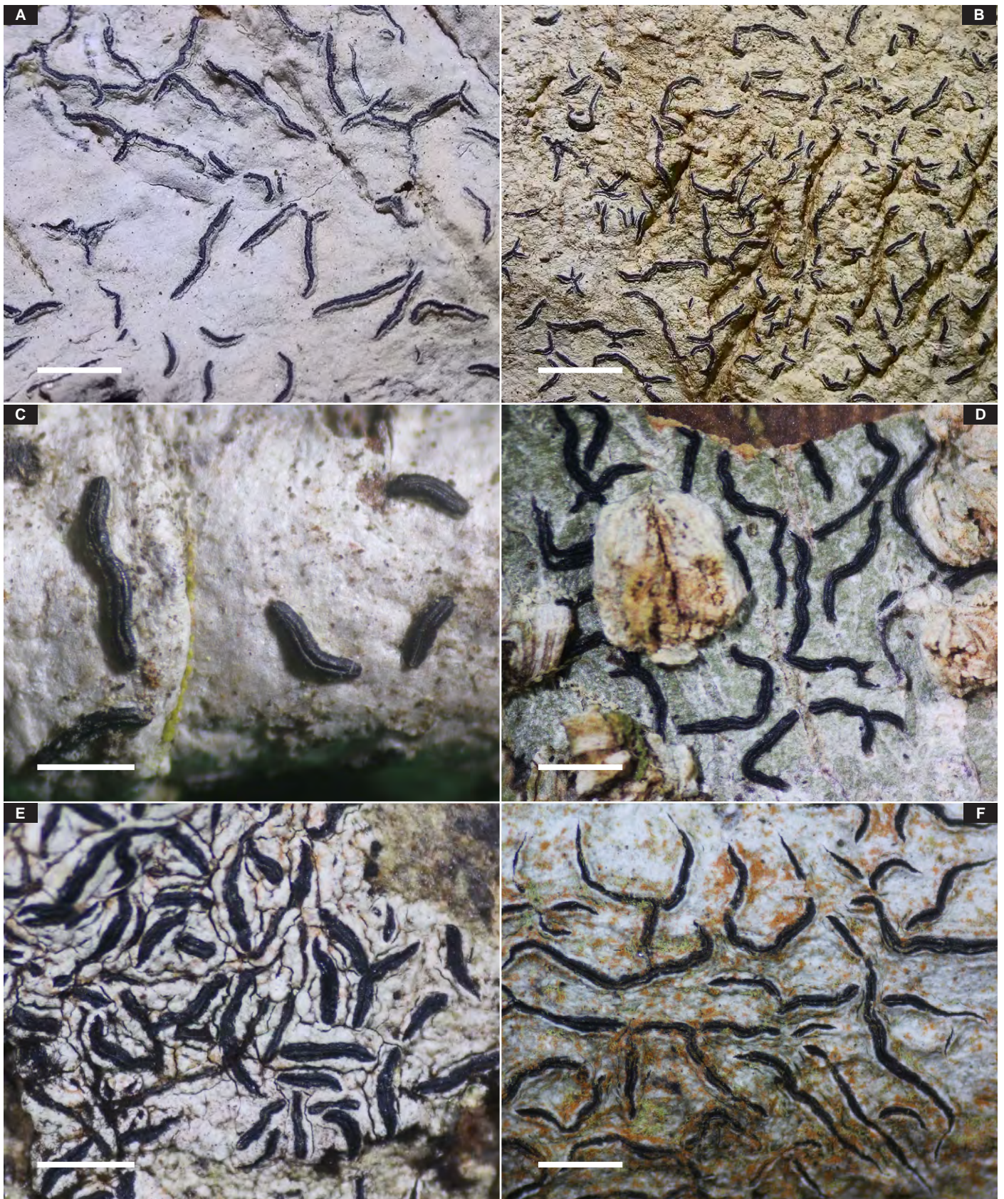
Fig. 2: Habitus and ascomata of Graphis species. A – G. aperiens ; B – G. cincta ; C – G. conferta ; D – G. duplicata ; E – G. immersicans ; F – G. leptoclada . Scale bars: A=5 mm, B=3 mm, C=1 mm, D=2 mm, E=2 mm, F=2 mm.