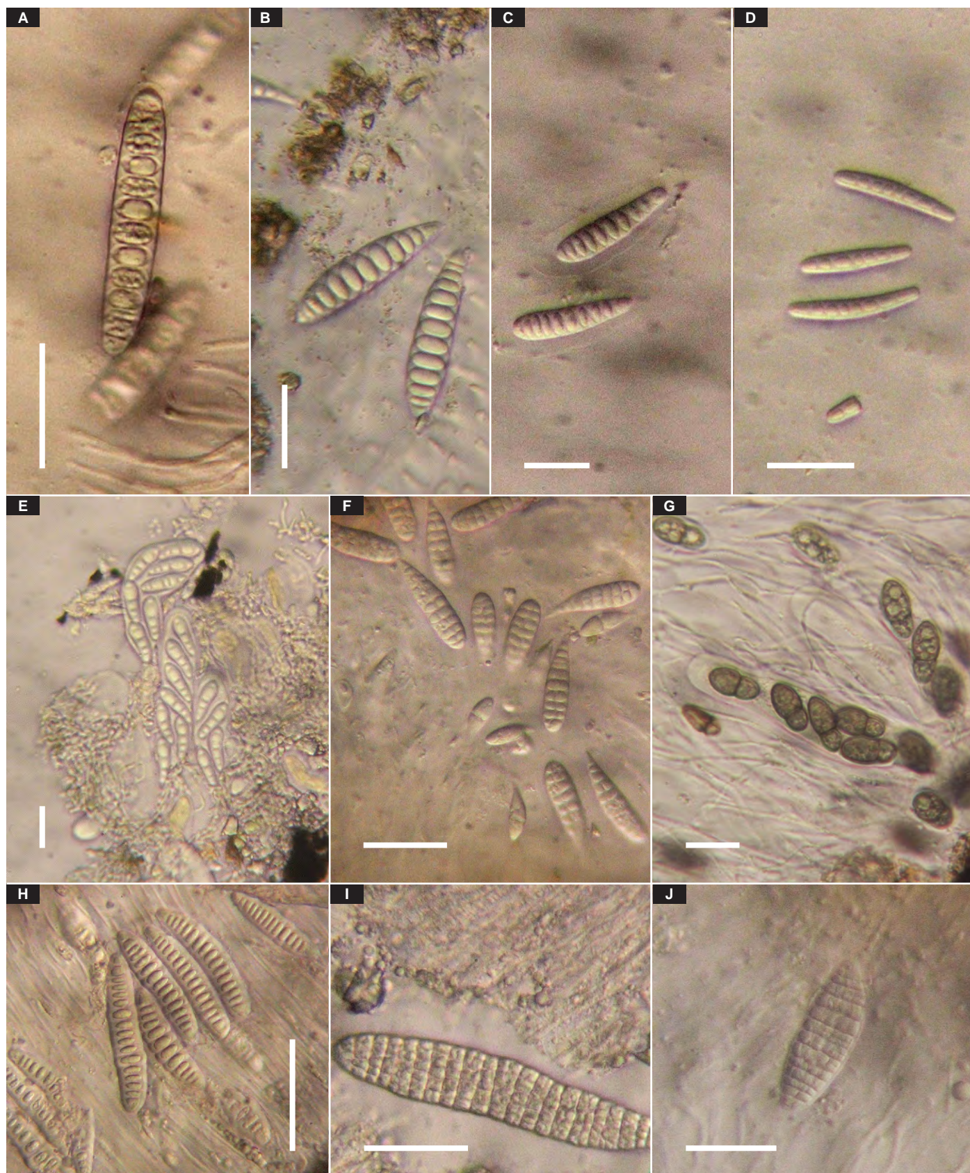
Fig. 4: Ascospores. A – Graphis leptoclada ; B – Graphis conferta ; C – Graphis aperiens ; D – Enterographa sp.; E – Fouragea viridistellata ; F – Thallolooma jareinense ; G – Bogoriella miculiformis ; H – Thelotrema porinoides ; I – Platygramme muelleri ; J – Wirthiotrema glaucopallens . Scale bars: A=20 \mu m, B=20 \mu m, C=10 \mu m, D=20 \mu m, E=15 \mu m, F=20 \mu m, G=15 \mu m, H=50 \mu m, I=30 \mu m, J=30 \mu m.