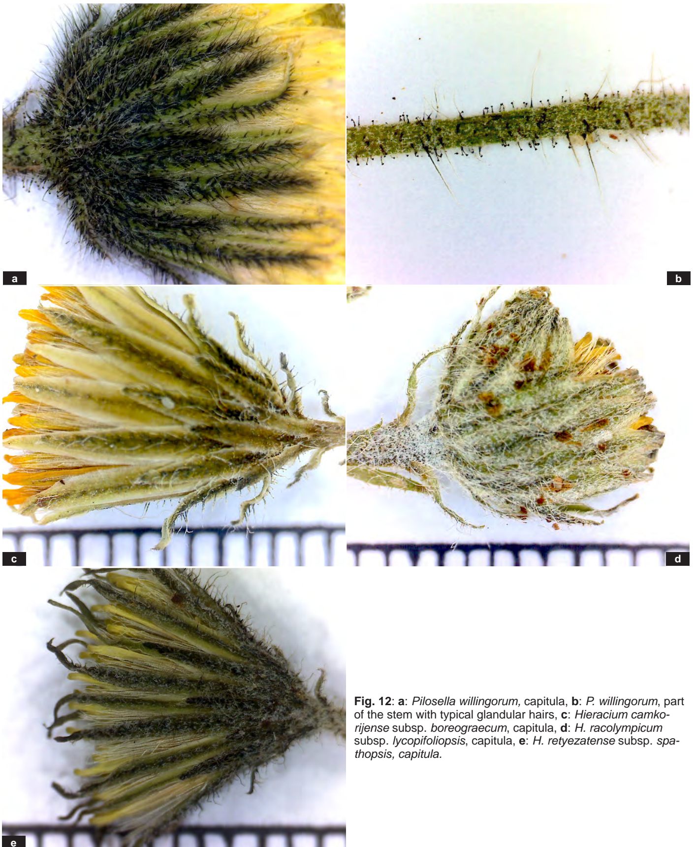
Fig. 12: a: Pilosella willingorum , capitula, b: P. willingorum , part of the stem with typical glandular hairs, c: Hieracium camkorejense subsp. boreograecum , capitula, d: H. racolypticum subsp. lycopifoliopsis , capitula, e: H. retyezatense subsp. spatopsis , capitula.