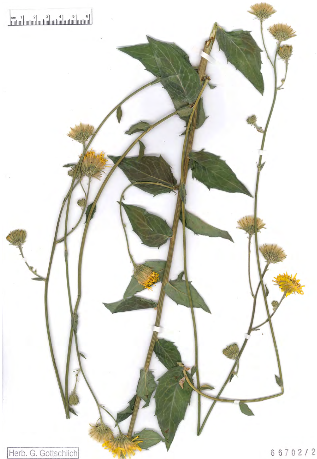
Fig. 4b: Hieracium sabaudolympicum GOTTSCHL. & DUNKEL, middle part of the stem.