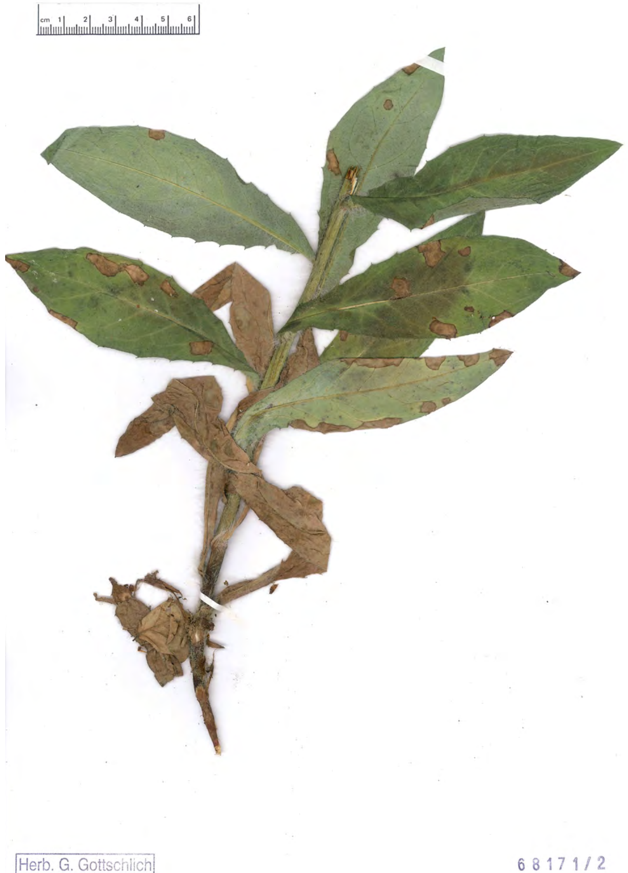
Fig. 9b: Hieracium racolympicum subsp. lycopifoliopsis GOTTSCHL. & DUNKEL, lower part of the stem.